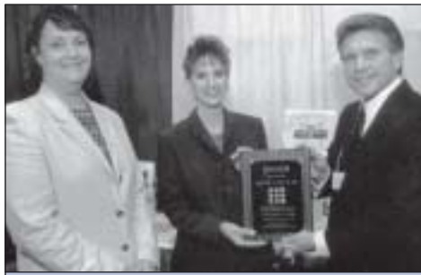
Hill's Pet Nutrition, Inc.