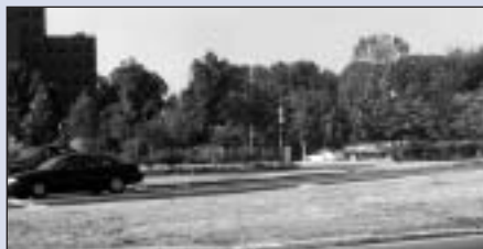
Site of Teaching & Research Building Planned Groundbreaking 2003