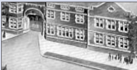
Quadrangle Building 1907