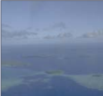
Aerial View of the Vava'u Island group, Kingdom of Tonga.

They asked for copies of my veterinary licenses and diploma, which I gave them, and they said "OK". That was