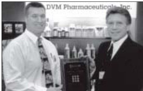
DVM Pharmaceuticals, Inc.