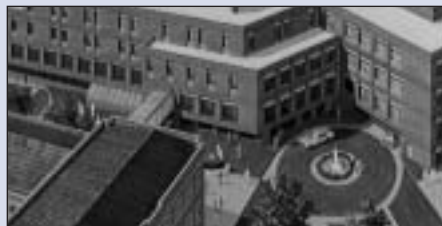
Veterinary Hospital of the University of Pennsylvania 1981