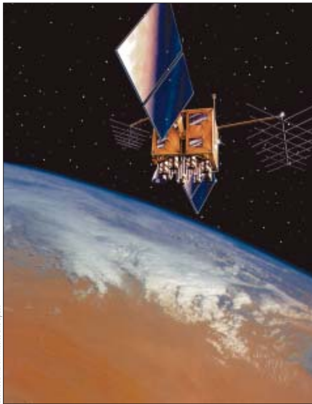
Lockheed Martin Missiles and Space

and other diseases." The system facilitates the analysis of data such as type and number of birds affected or the companies involved. It allows the integration of travel routes for feed, bird and egg trucks, schedule of service personnel, etc. into the program. The role of environmental factors can be analyzed as to whether the spread of disease is mechanical in nature (i.e. personnel or vehicles) or whether wind or water play a role.