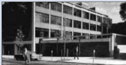
Gladys Hall Rosenthal Building 1963