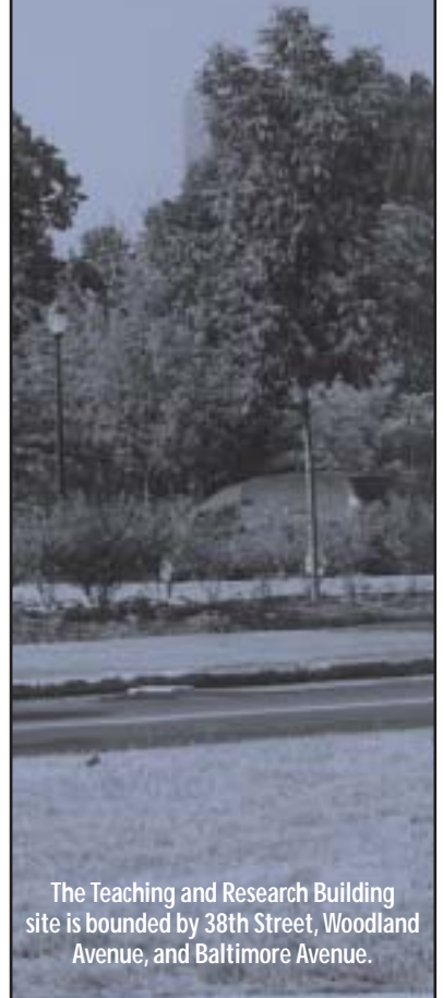
The Teaching and Research Building site is bounded by 38th Street, Woodland Avenue, and Baltimore Avenue.