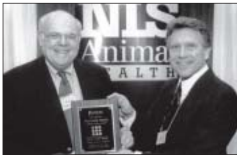
NLS Animal Health

Mark your calendar! 2003 Penn Annual Conference January 29 and 30