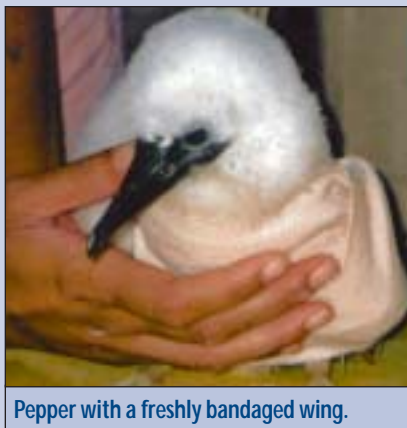
Pepper with a freshly bandaged wing.