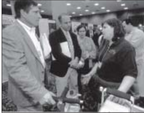
In the exhibit hall

The 2003 Conference is scheduled for January 29-30, 2003, at the Adam's Mark Hotel in Philadelphia. Please bookmark the web site, < http://alumni.vet.upenn.edu/pennannualconference.htm >, and check your mail in the fall for the 2003 Penn Annual Conference brochure.