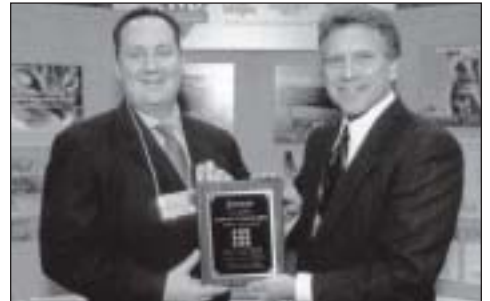
Innovative Veterinary Diets