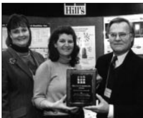
Hill's Pet Nutrition