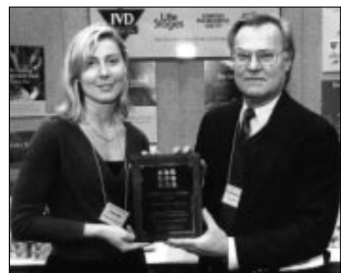
Innovative Veterinary Diets