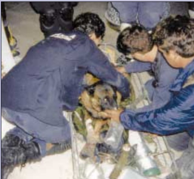
Dr. Otto examining a dog in distress

The conditions under which dogs and people worked were dangerous. They had to maneuver on a huge pile of building debris, where gigantic steel beams rested precariously, one on top of the other. They had to watch their footing and be prepared for sudden holes. There was smoke, noise of huge cranes and hauling equipment, dust, and a great variety of odors. Everything was bathed in incredibly bright light from the many high-powered lights on the site. The humans wore masks and protective shoes and clothing. The dogs could not have masks nor could they work in booties — thousands of which had been donated by a well-meaning public — because they needed to feel the terrain with their feet to avoid accidents.