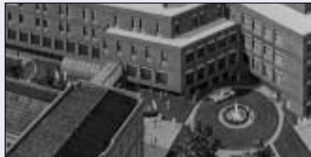
Veterinary Hospital of the University of Pennsylvania 1981