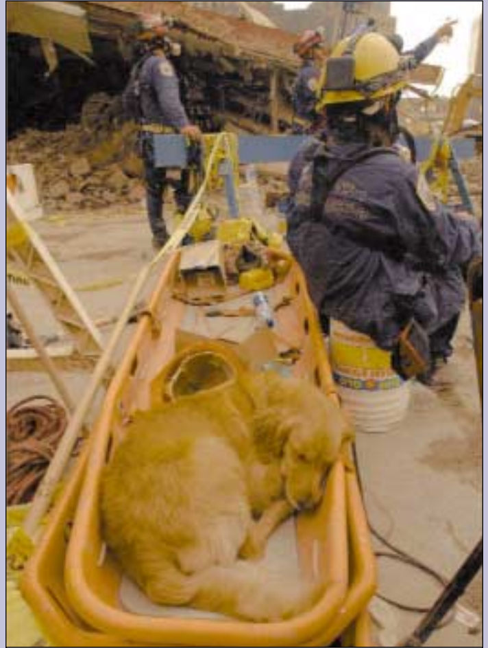
A quick nap

“What was a typical night at Ground Zero?” said Dr. Otto. “The night shift would load up on buses or military vehicles for the trip to Ground Zero. The streets were lined with New Yorkers cheering on the workers. It was a powerful way to start a shift. The busiest component of the team was the search component, the dogs and also technical search (using specialized search cameras and listening devices). The dogs would be sent out to the “pile” with the handler. They would search areas of rubble looking for live victims. Although they are trained for “live find,” it soon became evident that the dogs were also able to identify remains of victims.”