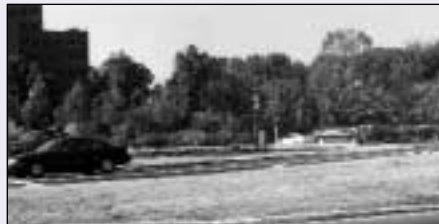
Site of Teaching & Research Building Planned Groundbreaking 2003