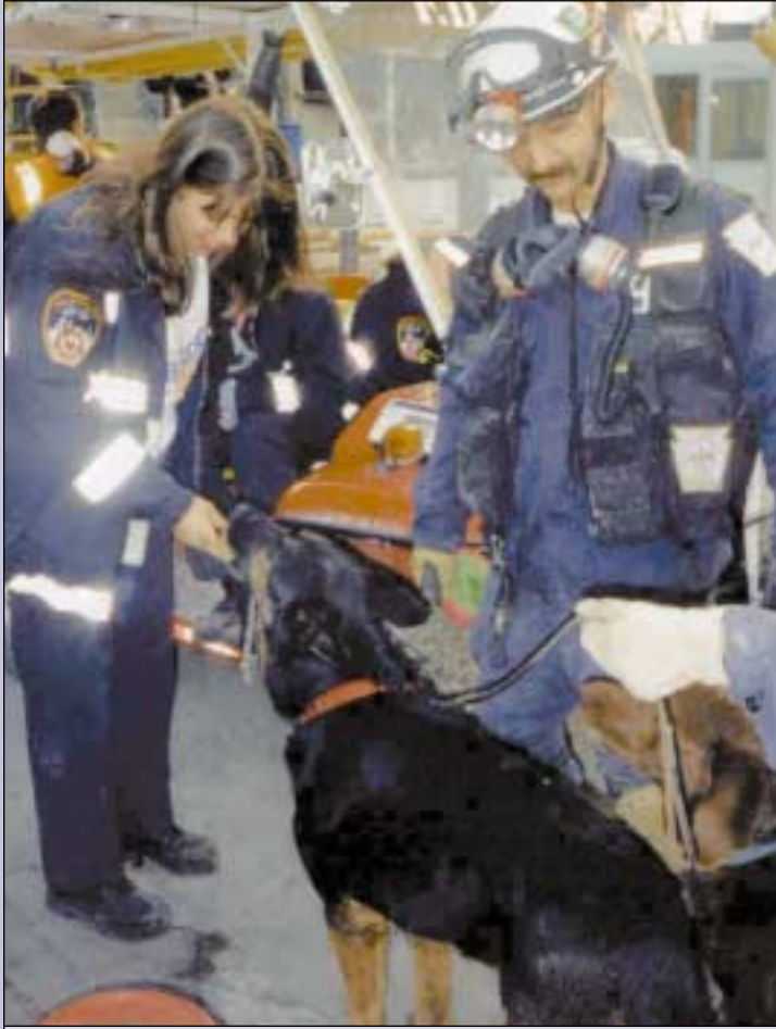
Taking a break with one of the dogs

dogs as much as possible and get them to drink water. These are very intense dogs, they are driven and will work until they drop. So dehydration was a big danger. The other dangers were the dust and the noxious fumes. I rinsed their eyes every 30-45 minutes. Their feet too were washed at that time to flush away the fine dust. I bandaged wounds and treated minor cuts on site. More serious problems were treated by the Suffolk County, N.Y., SPCA van that was used by the Veterinary Medical Assistance Team (VMAT), located about five blocks from Ground Zero.”