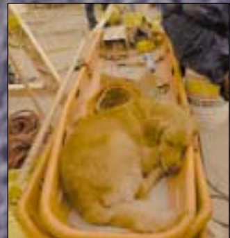
Ground Zero, page 14