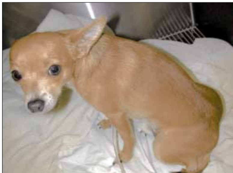
Binni with a huge hematoma.

and platelets. Each cellular component has its own function within the body: red blood cells are responsible for carrying oxygen from the lungs to all vital tissues and organs, white blood cells help the body fight infection, and platelets are a necessary part of the body's clotting mechanism. Plasma acts as a carri-