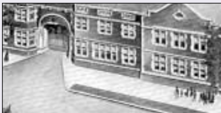
Quadrangle Building 1907