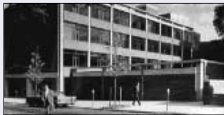
Gladys Hall Rosenthal Building 1963