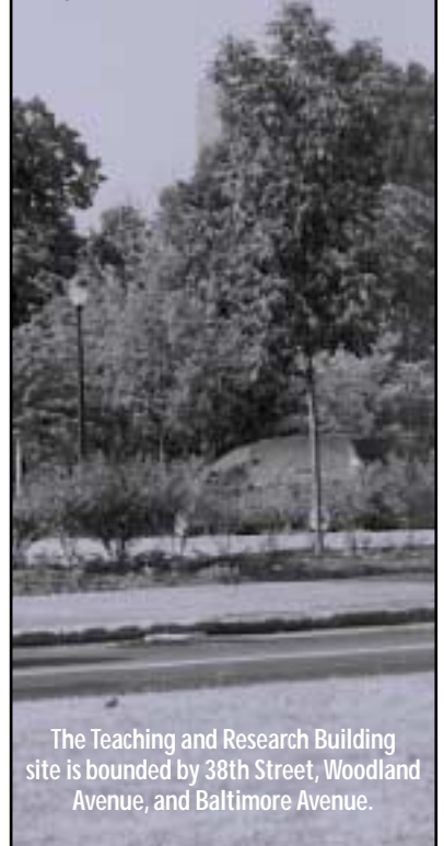
The Teaching and Research Building site is bounded by 38th Street, Woodland Avenue, and Baltimore Avenue.