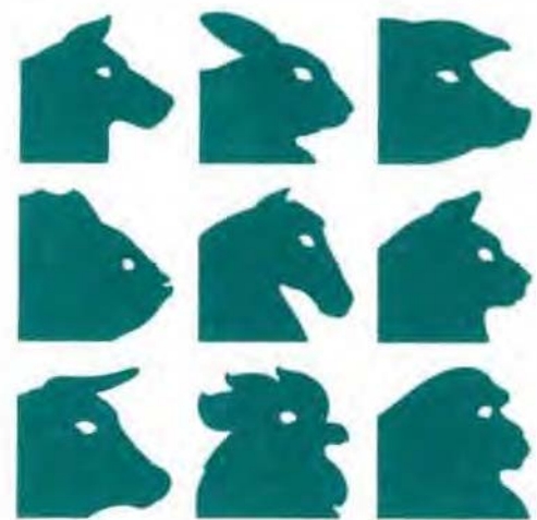
New logo designed for the School's centennial.