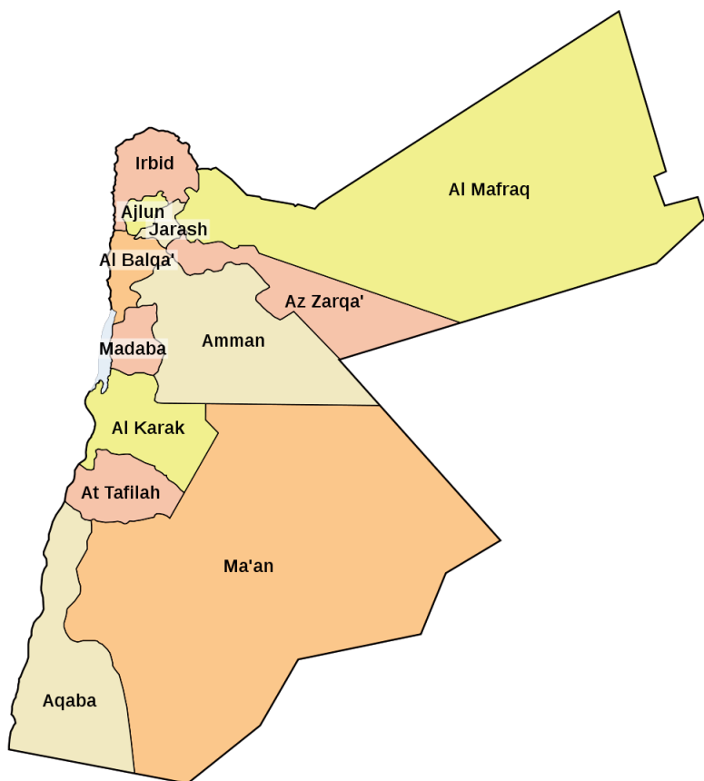
Table 3. Cohort Locations by Governorates (Provinces)

Each cohort targeted educators from different regions of Jordan (See Table 3 below). The educators in Cohort 1 were from Amman, which is also where QRTA’s headquarters are located. The networks for Cohort 2 were from governorates, or provinces, in the southern region of Jordan. Some of the schools were more than a two hour drive from Amman making it difficult for participants to come to QRTA, so the workshop teams often held the professional development sessions at network schools. The Cohort 3 governorates were slightly closer to Amman as they were in the Northern region of Jordan, but still quite a distance from Amman. Again, workshop leaders transferred much of the professional development to schools within the networks.