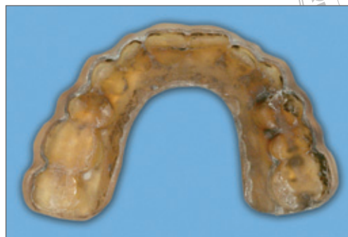
Fig 2 Heavily stained acrylic maxillary occlusal appliance.