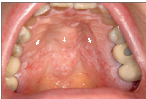
Fig 1 Diffuse area of striae and erythema affecting the central and vertical portions of the palate (arrows).