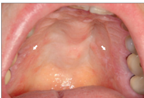
Fig 3 Significant resolution of central palatal lesions 1 month after cessation of OA use. Striae with mild erythema can be observed on the vertical portions of the palate only (arrows).