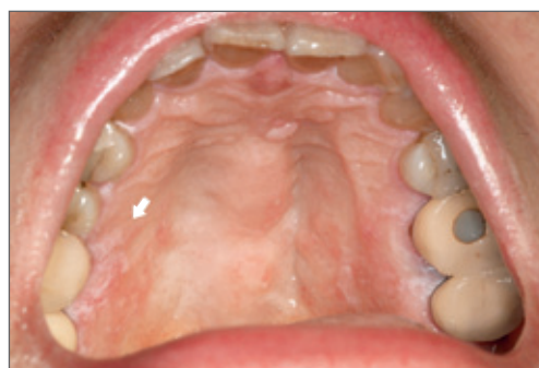
Fig 4 Continued resolution of palatal lesions on 6 week reevaluation. The only remaining area of striae and mild erythema is noted on the vertical portion of the right palate (arrow).

Physical examination revealed a well-nourished woman in no apparent distress. Extraoral examination did not reveal lymphadenopathy, thyromegaly, salivary gland enlargement, or cutaneous lesions. Intraoral examination revealed a diffuse area of striae with erythema primarily on the palate (Fig 1).