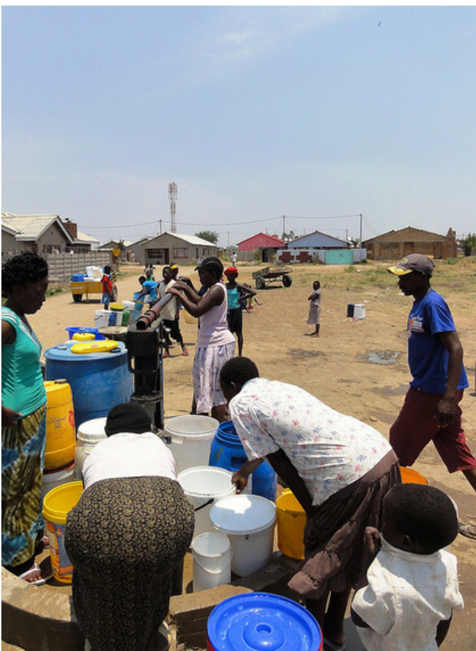
Some residents and some vendors are fetching water. Photo taken by P. Feiereisen on 19 October 2011 in Norton, Zimbabwe. Flickr

While users from the remaining Wards appreciated the importance of boreholes only 46% of them recognized the borehole as an important source of water. This value is lower than that of Ward 14. The villagers collective action in using alternative water sources lo-