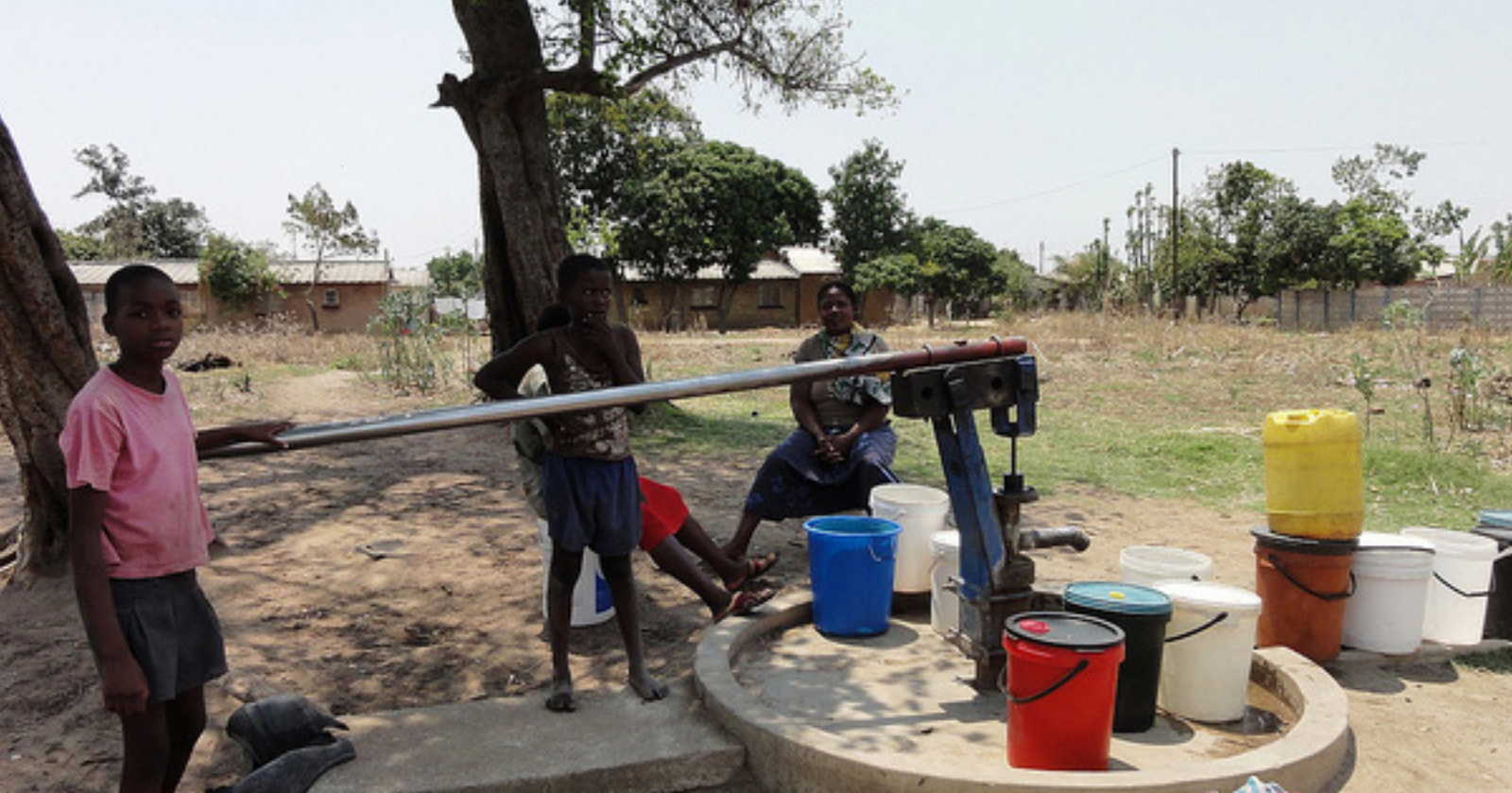
Women and children at a borehole. Photo taken by P. Feiereisen on 19 October 2011 in Norton, Zimbabwe. Flickr

In trying to provide access to safe water for all rural people, the Zimbabwean government is faced with the problems of constructing new water facilities and maintaining existing ones. Wijk- sijbesma (1985) indicates that inaccessibility of boreholes due to dilapidation and a prohibitive management system poses huge challenges particularly to women water users (majority water users and managers) who inevitably have to walk longer distances to alternative sources of water. This was also observed by Narayan (1994) who contends that the consequences endured by women include physical strain through heavy loads and rough terrains which becomes detrimental, compromising their productive and reproductive roles at the household and community levels.