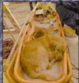
Ground Zero, page 14