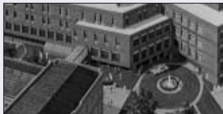
Veterinary Hospital of the University of Pennsylvania 1981