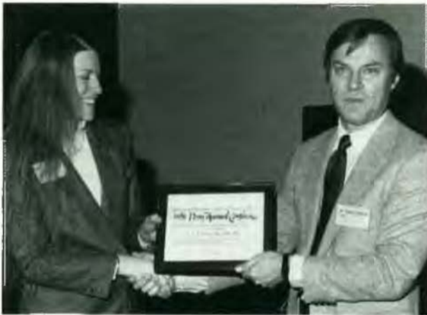
A.J. Buck and Son, Inc.