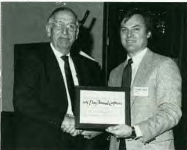
Peterson Imaging, Inc.