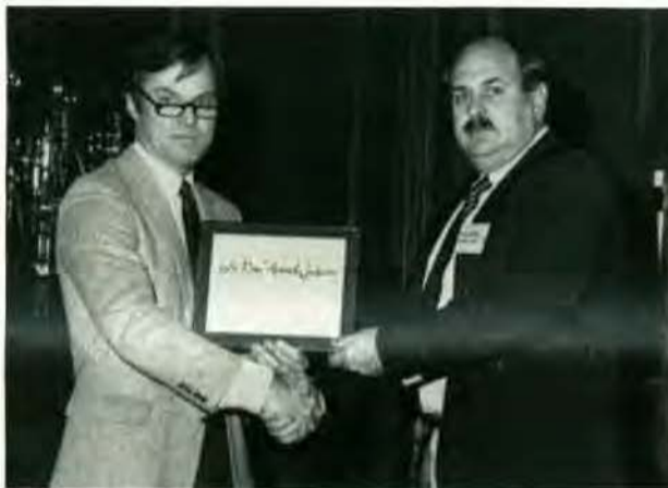
Daniels Pharmaceuticals, Inc.