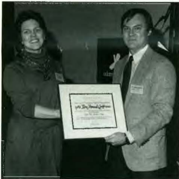
ALPO Petfoods, Inc.