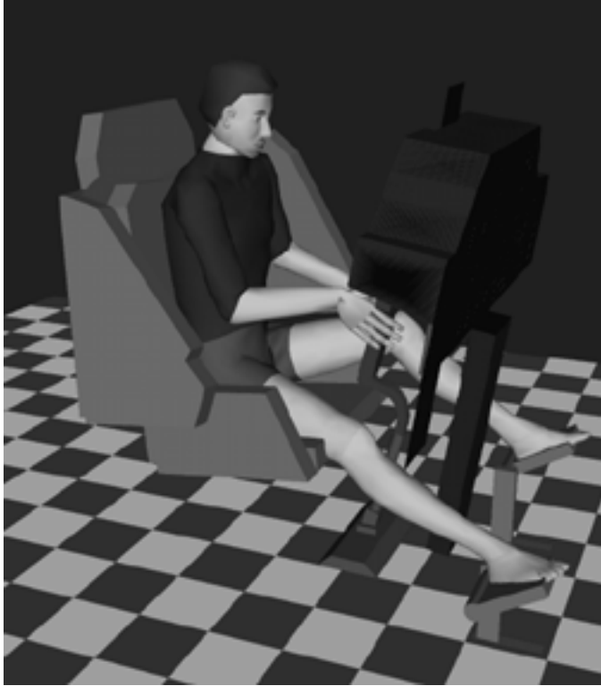
Figure 2. Smooth body Jack as virtual occupant in an Apache helicopter CAD model.