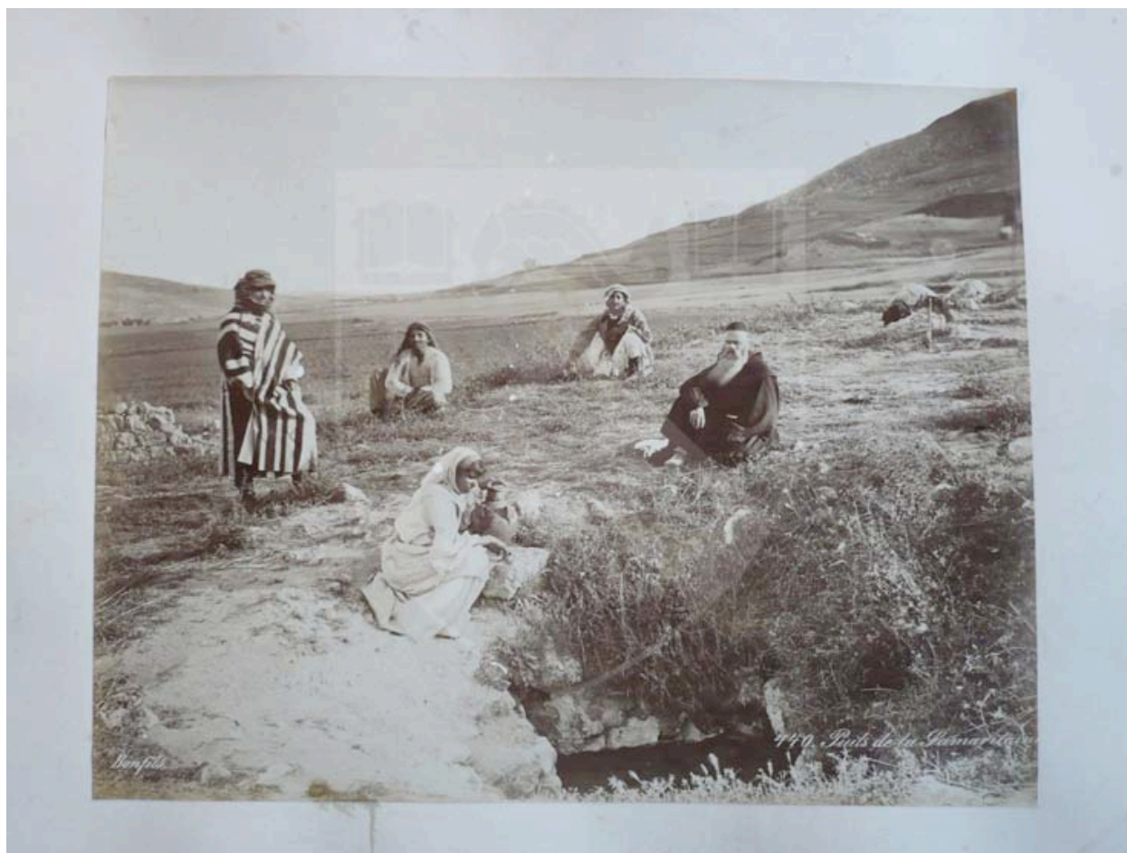
Figure 1: Bonfils, Jacob's Well, 1880s.