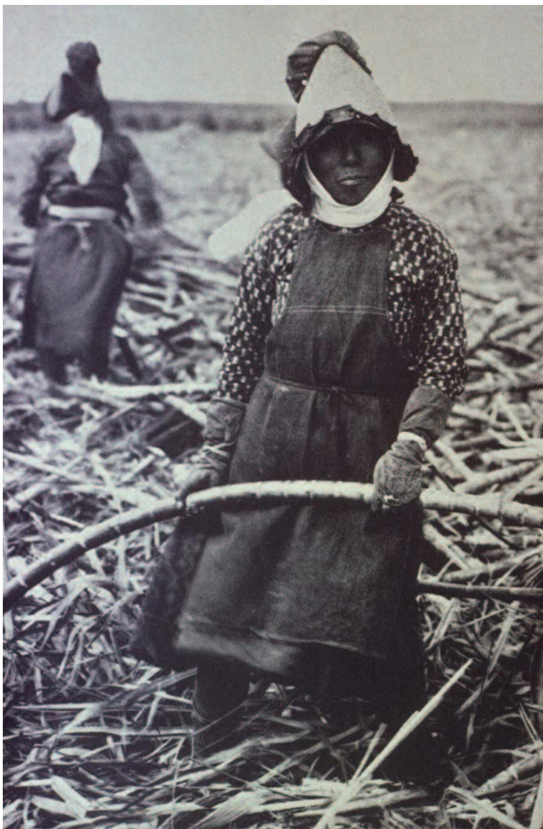
Women harvesting sugarcane on Maui, circa 1920