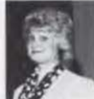
A.J. Buck & Son, Inc.