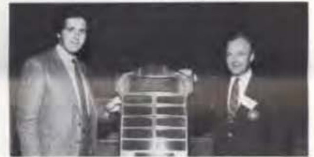
Dermatologic for Veterinary Medicine, Inc.