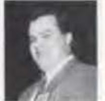
Hills Pet Products