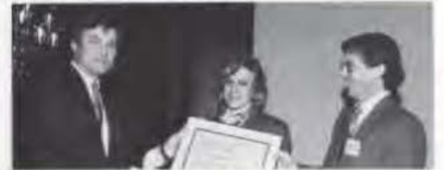
Peterson Imaging, Inc.