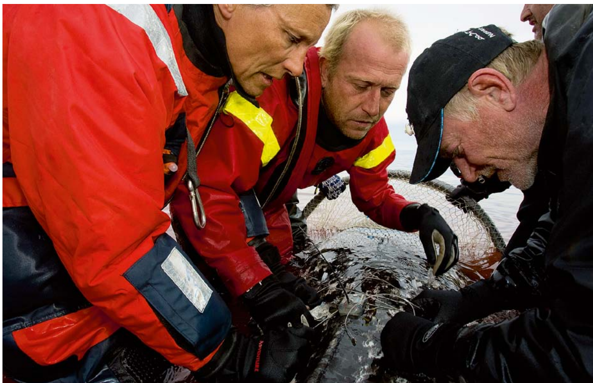
Scientists attach a satellite tag to a male narwhal.