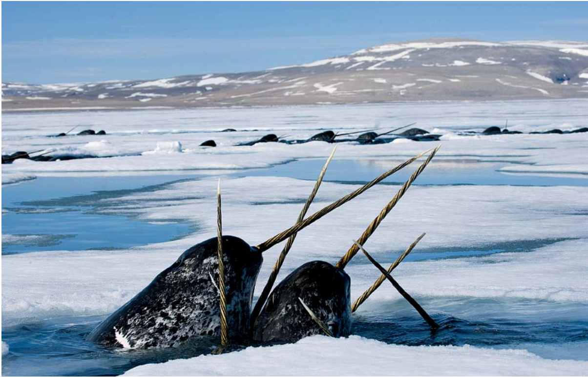
Being infrastructure is hard work. Narwhals, after a long day on the job, surfacing to catch a breath off of Baffin Island, Nunavut, Canada.

with television cameras would allow researchers to get a close-up view of dolphins in their natural environment. Inevitably, perhaps, Evans and fellow Lockheed engineer William Sutherland had dubbed the latter the “Motorized Observation Biotelemetry Yacht–Data Integration and Control,” or MOBY-DIC. 12