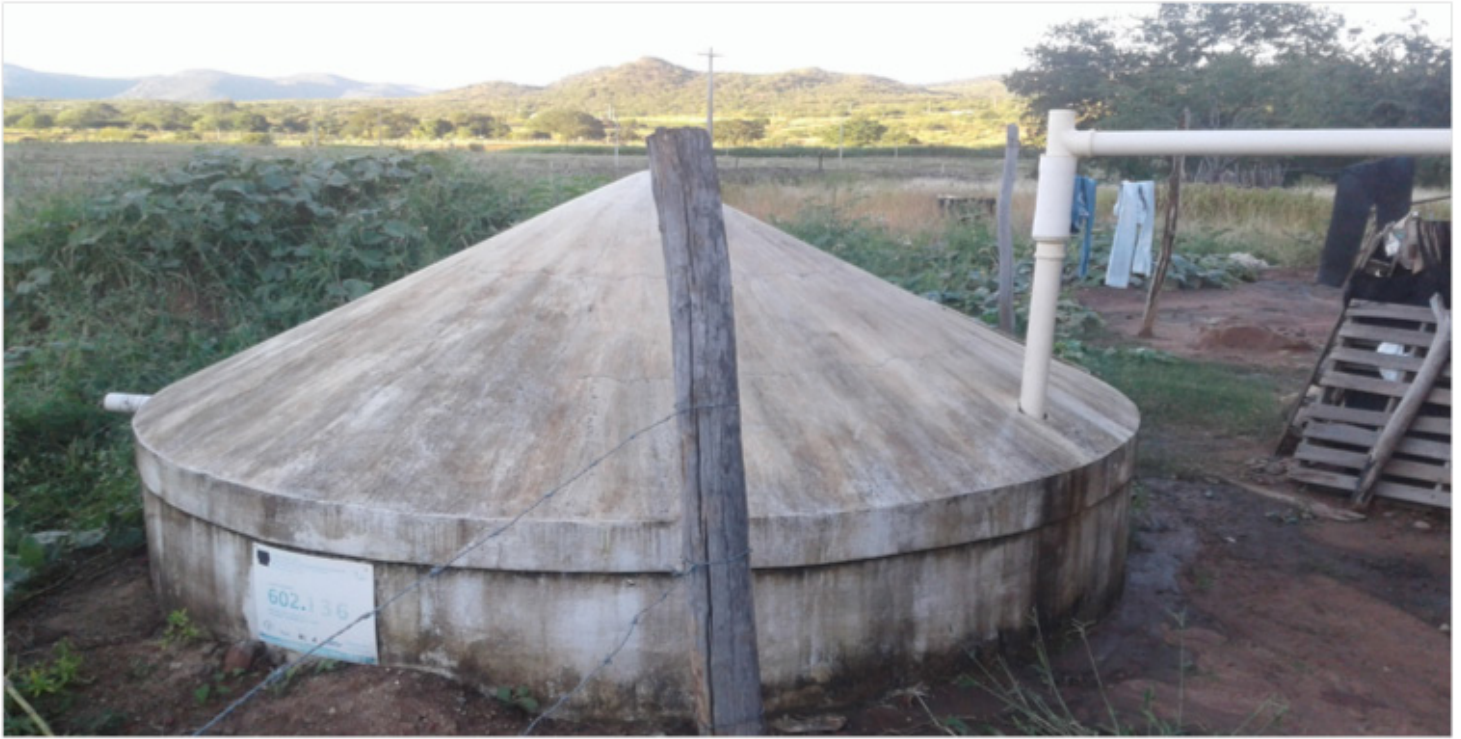
Figure 1. Social technology: The cistern

develop the network's training and mobilization proposals. The municipal committee and local NGOs selected families likely to benefit the most, considering the number of cisterns to be built, with the following criteria in order of priority (CGU, 2011):