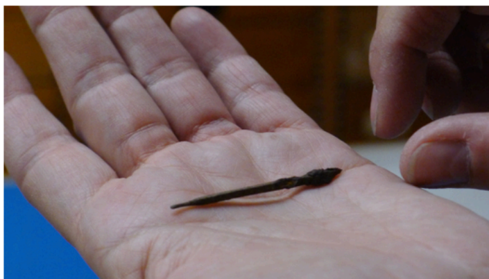
An iron nail excavated from the Fort Shantok, re-worked to fit into a bow drill or pump drill. Item #10289 housed in archaeological storage at the Yale Peabody Museum of Natural History, Connecticut Tier 78, Drawer 4.

There it lies. In an archaeological collections drawer in the Yale Peabody Museum of Natural History in New Haven, in Connecticut Tier 78, Drawer 4. A single wrought iron nail (perhaps a ship's nail) rests amidst bits of copper and other metal debris, European trade goods, clay pipe fragments, and a rusty jaw harp, all recovered from a layer of earth four centuries past. This material was salvaged from a dig at Fort Shantok (also called Uncas's Fort, at Trading Cove), a well-known 17th century Mohegan habitation site, in the homelands of the present-day Mohegan Tribe . At first, this nail is almost too ordinary to notice...but its shape is unusual. This common nail, hammered and drawn from quarter-inch squared iron rod stock (typical of the 17th century) has been re-worked, and the point has been drawn out and narrowed into a tubular shape. Also, the head has been flattened in such a way that it would never hold a wooden seam secure. Who would alter such a good nail? To what purpose?