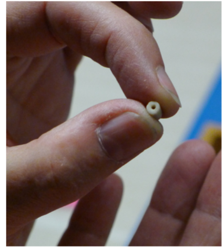
"1 piece of shell wampum, perforated, Fort Shantok, Mohegan, CT." Item #10221, housed in archaeological storage at the Yale Peabody Museum of Natural History, Connecticut Tier 78, Drawer 5.

Weeks later, at the Canadian Museum of History , far to the north, we examined two bow drills, each crafted from bent wood strung with leather cord. Before European contact, Native hand drills, pump drills, and bow drills just like these were fitted with a stone point serving as a bit to bore holes. The bit was secured in a piece of wood which was wrapped with the cord of the bow (or rubbed with the hands) to rotate it. The speed of rotation generated the necessary heat and friction to bore holes in wood, shell, stone. But the bits in these bow drills at CMH are not stone. Each is fitted with a cast-off wooden spool and...a sharpened nail.