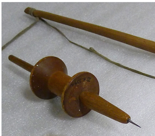
A bow drill fitted with a cast-off industrial spool and an iron nail for a bit. Canadian Museum of History, item #III-H-334 a-c, identified as Huron-Wendat, collected by Frank Speck.

Weeks later, at the Canadian Museum of History , far to the north, we examined two bow drills, each crafted from bent wood strung with leather cord. Before European contact, Native hand drills, pump drills, and bow drills just like these were fitted with a stone point serving as a bit to bore holes. The bit was secured in a piece of wood which was wrapped with the cord of the bow (or rubbed with the hands) to rotate it. The speed of rotation generated the necessary heat and friction to bore holes in wood, shell, stone. But the bits in these bow drills at CMH are not stone. Each is fitted with a cast-off wooden spool and...a sharpened nail.