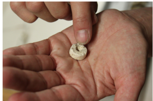
An old disk bead from a California site, showing a conical hole bored by a stone bit.

Technically, beads were "bored" rather than "drilled," using high-speed rotation and pressure to puncture the shell without shattering, and water to keep the heat and dust in check. New France journals note that by the 1610s, Native people living along the Saint Lawrence seaway were already familiar with (and specifically requesting) awls as trade goods. But the awl was not the first innovation in drilling technology. Nails from ships manned by Breton fisherman (or even Viking adventurers) could have been procured centuries earlier. A Native artisan could just as easily fit an Indigenous bow drill with an awl, or with a simple iron nail.