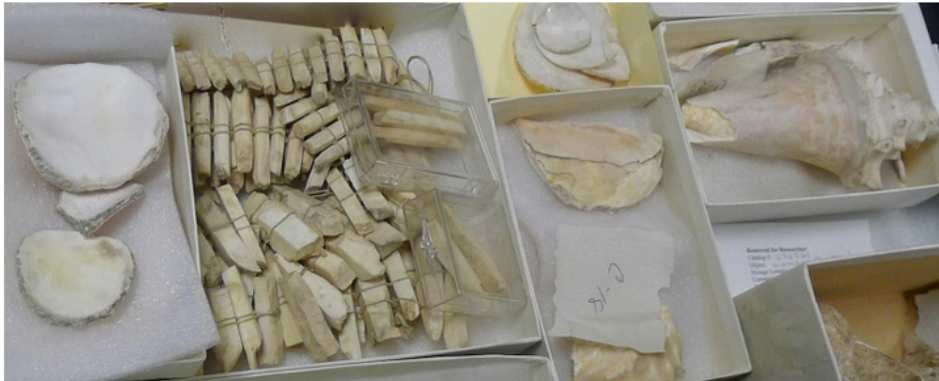
Conch shells and blanks collected from the Campbell wampum manufacturing site in New Jersey.

wampum crafted from whelk. Once our eyes had been properly trained, we found it relatively easy to distinguish among the different kinds of white wampum beads found in various collections, whether made from whelk, conch, or porcelain.