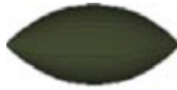
Figure 4: Wound Path Space for a Gunshot Wound