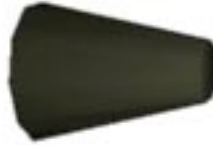
Figure 5: Wound Path Space for a Stab Wound

structures. At this point, identification of (potentially) affected anatomical structures is used differently in MediSim and TraumAID. For TraumAID, the system currently highlights and lists those anatomical structures determined to lie in the wound path space. For MediSim, posterior probabilities of anatomical structure involvement generated by the penetration path assessment system can be used to update the posterior probabilities of particular injuries. One or more high-likelihood injuries can then be attributed to the casualty.