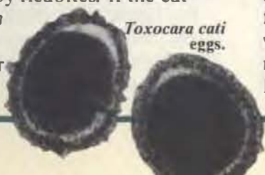
Toxocara cati eggs.