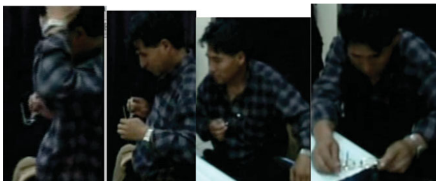
FIGURE 2. Word search and deliberation embodied.