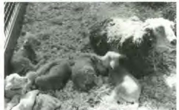
Five lambs were born to a two-year old ewe at New Bolton Center. The lambs, four females at six pounds each and one male, at four pounds, and their dam were cared for in the Graham French Neonatal Intensive Care Unit for a few days. The ewe is part of the School's teaching flock.