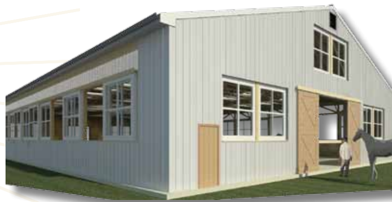
Artist's rendering of the Equine Performance Evaluation Facility.

A significant example of progress on our campuses is the planned Equine Performance Evaluation Facility, for which ground is anticipated to be broken in March, 2012. The trend in equestrian sport is towards disciplines like dressage, show-jumping and three-day eventing. Care of the equine athlete demands specialized facilities in which to evaluate performance, diagnose subtle lamenesses and detect musculoskeletal problems using sophisticated equipment in conjunction with our clinicians' highly developed observational powers. For New Bolton Center