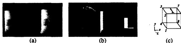
Fig. 2. (a) Uncompressed (left), and compressed (right) axial MR slice of phantom, (b) 3D view of model (left), axial slice through center of inclusion (middle), axial view of inclusion center (right), before and after compression, (c) Corner identification numbers for the stiff inclusion

The average errors in displacements were 0.34mm, 0.66mm, and 0.40mm in the x , y and z directions respectively, and are within the maximum imaging error. The results show that the methodology used to create the phantom model using BreastView is sound since it results in a model, which yields virtually the same inclusion displacements as the PATRAN-generated model.