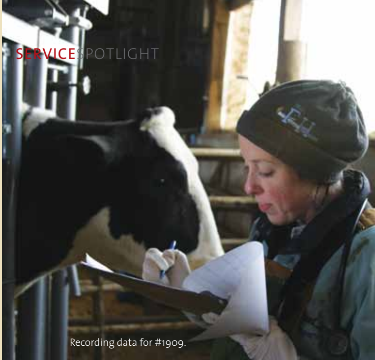
Recording data for #1909.