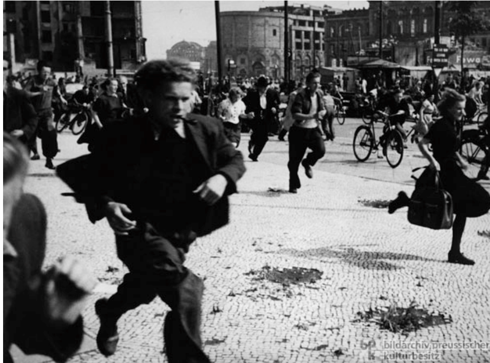
East German Uprising, June 17, 1953. Demonstrators fleeing down Leipziger Straße and across Potsdamer Platz into the adjacent British sector.