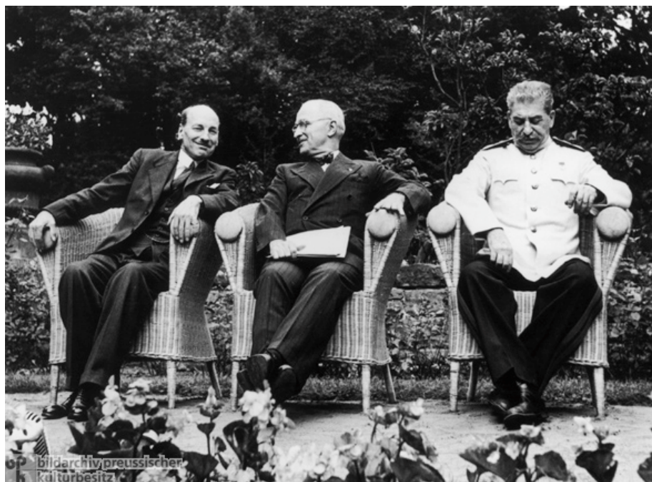
The Potsdam Conference was held between July 17 and August 2, 1945. Here (from left to right) British Prime Minister Clement Attlee, United States President Harry Truman, and leader of the Soviet Union, Josef Stalin.