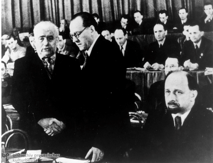
The founding of the SED on April 21, 1946. Here (front left) Wilhelm Pieck (KPD) and Otto Grotewohl (Eastern SPD) shake hands. Seated on right, Walter Ulbricht.

A warning to commuter train ( S-Bahn ) passengers that Spandau is the last stop before entering the Eastern Zone. The sign goes on to say that continuing on places one at risk for imprisonment.