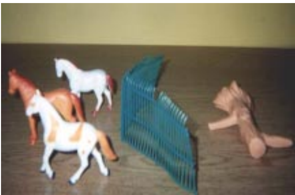
Some of the horses jumped over the fence