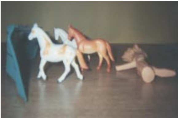
The horses are about to jump over the fence