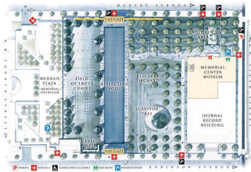
Figure 4: Oklahoma City National Memorial site map.