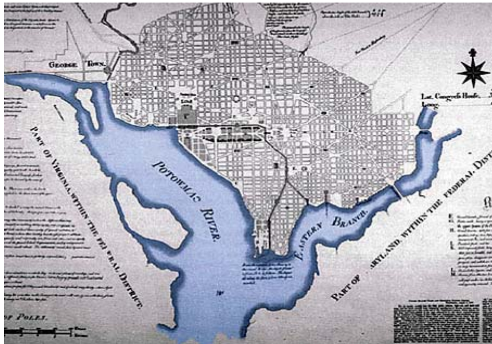
Figure 7: L'Enfant Plan for Washington, DC, 1791.