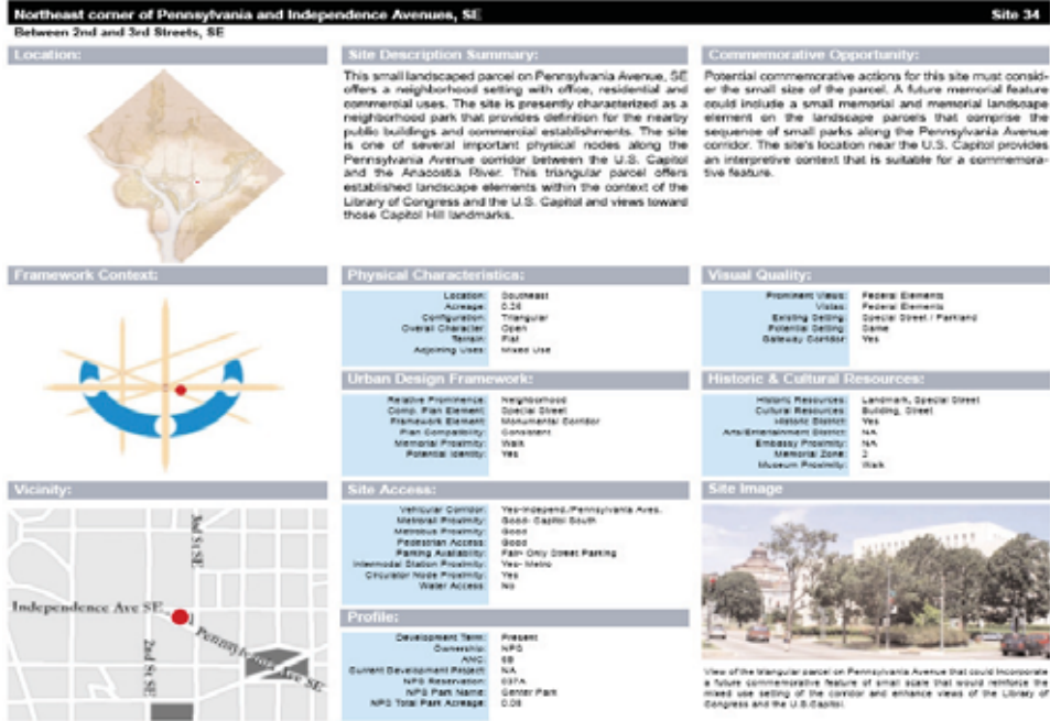
Figure 9: Page from Memorials and Museums Master Plan detailing one suggested site for a future memorial in Washington, DC.