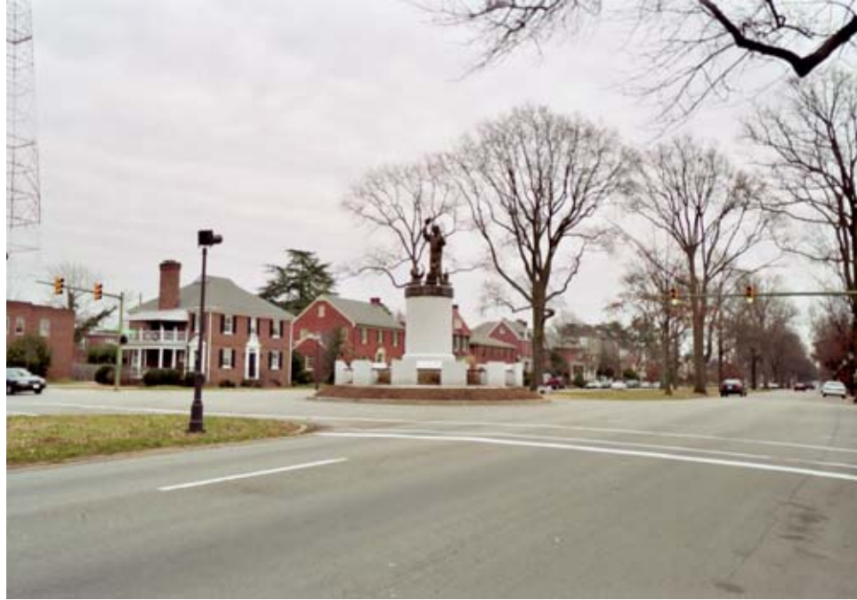
Figure 6: Arthur Ashe Monument, Monument Avenue.