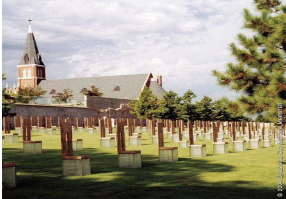
Figure 3: Oklahoma City National Memorial.