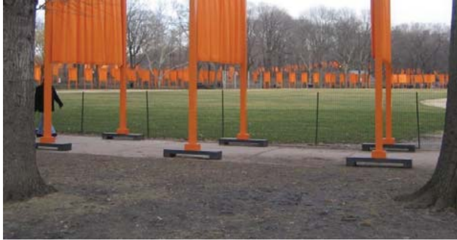
Figure 5: “The Gates, Central Park, New York City 1979-2005. [Christo and Jeanne-Claude, 2005]