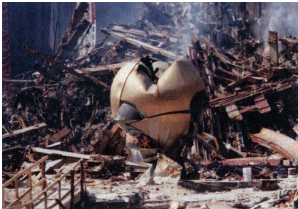
Figure 2: The Sphere at Plaza Fountain . [Fritz Koenig, 1971] This is the Sphere as it was found at Ground Zero. It now sits in Battery Park as a memorial.