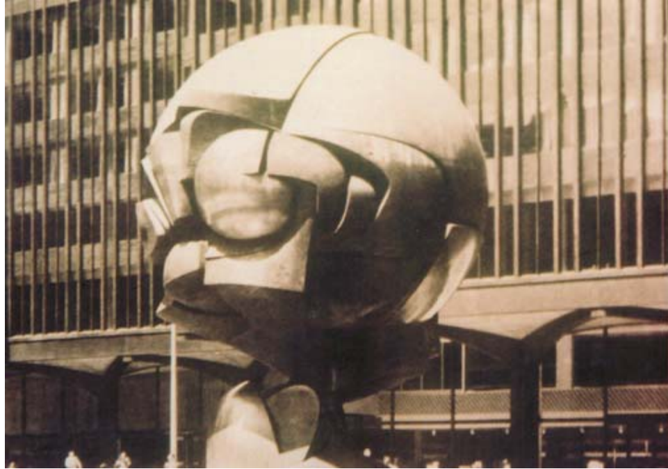
Figure 1: The Sphere at Plaza Fountain . [Fritz Koenig, 1971] This is the Sphere prior to the 9/11 attacks.