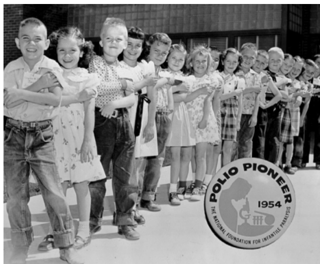
Children received the NFIP's "Polio Pioneer" badges after participating in the trial.

Second World War nearly a decade earlier, individuals were now called upon to assume their part in the name of scientific advancement. 42 In an image now iconic of the polio trial, a teacher stands in front of her students next to a blackboard which has written on it: "Making History. We are among the first children ever to be given Polio shots. So we are really making History today. We are lucky." This image suggests that the teacher assumed that everyone in the class was participating in the trial. It also demonstrates how children were told that it was a privilege to participate in the trial—just as the consent form mailed home to parents was in fact a "request to participate form"—and that teachers perceived participating as a classroom responsibility to "make history." 43 Another iconic image used for propaganda purposes by the NFIP shows children who had already received the vaccine lined up with their "Polio Pioneer" certificates, which were produced and distributed by the NFIP. The image is another demonstration of how much community spirit participation in the trial involved.