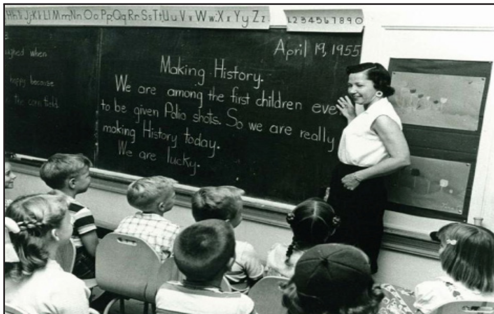
A teacher's message for her students regarding their historic role in the fight against polio.

In many ways, participating in the trial could be considered as a display of solidarity with one's community, since people were literally standing in line together to play a role in finding a cure to polio. The intense nationalism of the epoch also caused members of the public to view participating in the trial as an obligation for the nation's wellbeing; just as individuals were called upon to shoulder their part in the onerous war effort during the