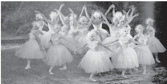
The Waltz of the Snowflakes in George Balanchine's 1954 Nutcracker