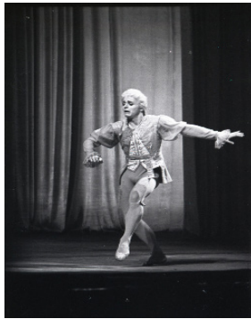
Baryshnikov in the role of Vestris