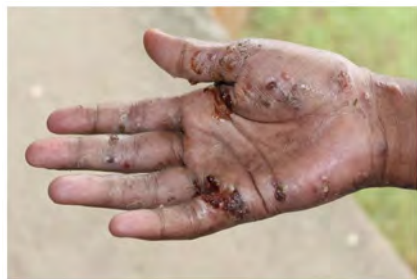
Figure 2. Hand of an adolescent girl in Fiji, demonstrating scabies infestation with typical secondary bacterial infection. doi:10.1371/journal.pntd.0002167.g002

We contend that global control of scabies is achievable, despite a number of impediments. Initial priorities include: i) raising awareness of scabies and engaging