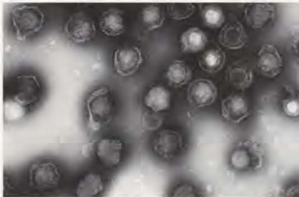
Bovine herpesvirus 1