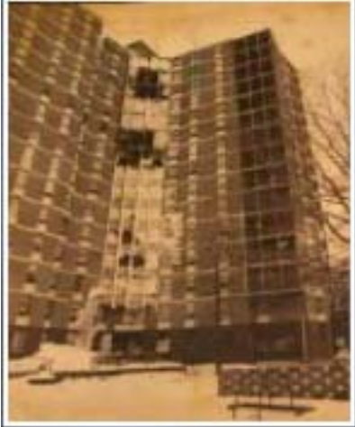
Figure 2: Old MLK Tower