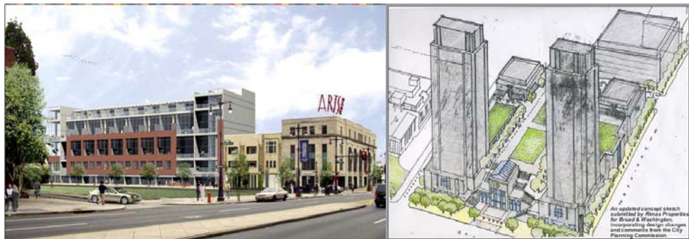
Figure 11: 1352 Lofts, South and Broad Figure 12: Sketch of Broad and Washington Proposal