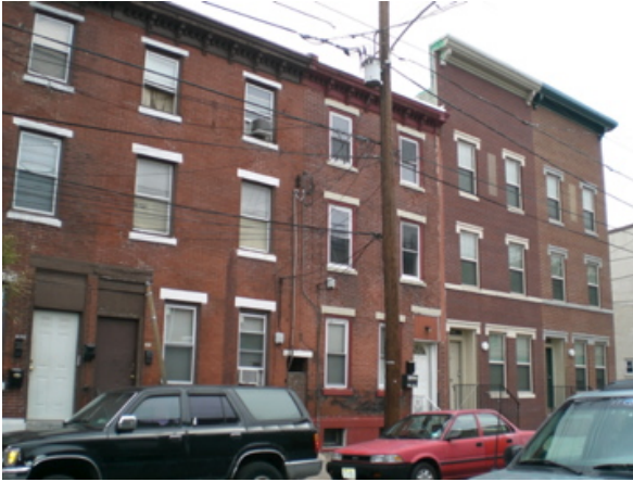
Figure 4: A typical Hawthorne street.