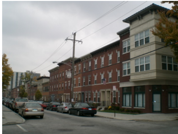
Figure 3: New MLK Plaza