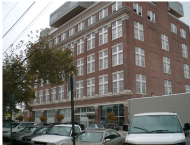
Figure 9: The Lofts at Bella Vista

At The Lofts at Bella Vista, brand new luxury condominiums on 11 th St. and Washington Ave., one bedroom units begin at $349,000 and two bedroom units go up to $549,990. 37 On Broad St. between Catherine and Fitzwater, Dranoff Properties has been approved for a mixed use, “luxury apartments over high-end retail development”. 38 There will be four stories of 146 residential units over 18,000 sq. ft. of retail space. The Hawthorne Empowerment Coalition asked that parking be underground, but the most recent plan has 155 above ground parking spaces. Prices for these residential units have not yet been determined.