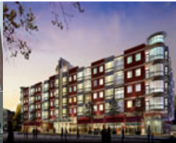
Figure 10: Simulation of Dranoff Proposal 39

Rimas Properties Inc. has nearly completed “1352 Lofts” on the 13 th block of South Street. This is another mixed-use development with retail beneath luxury apartments. Residential units range in price from $379,000 to $1.5 million. 40 Rimas is also in the planning stages of the most contentious residential development in Hawthorne, proposed for the currently vacant lot at Broad and Washington. For this area, Rimas