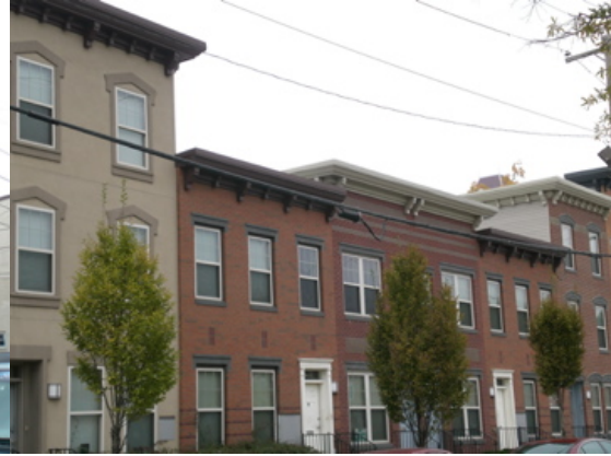
Figure 5: : MLK houses, different colors and heights.

Along with building on the site where the towers once stood, TGP built infill houses, renovating abandoned or blighted lots on nearby streets. I identified these TGP houses by making a visual survey and mapping the uses of the neighborhood (see Figure 1, Background Section). By building these infill houses, TGP truly wove their units into the fabric of Hawthorne. Visually, this acts as a litmus test for TGP, showing that their architectural style truly is aligned with the character of Hawthorne. Spatially, by scattering units TGP ensures that if the unit is affordable, that is, set below market price for those who qualify, the family won't be stigmatized based on location.