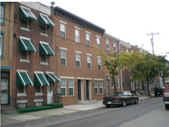
Figure 6: Block of Hawthorne with both MLK homes and existing homes.

Along with building on the site where the towers once stood, TGP built infill houses, renovating abandoned or blighted lots on nearby streets. I identified these TGP houses by making a visual survey and mapping the uses of the neighborhood (see Figure 1, Background Section). By building these infill houses, TGP truly wove their units into the fabric of Hawthorne. Visually, this acts as a litmus test for TGP, showing that their architectural style truly is aligned with the character of Hawthorne. Spatially, by scattering units TGP ensures that if the unit is affordable, that is, set below market price for those who qualify, the family won't be stigmatized based on location.