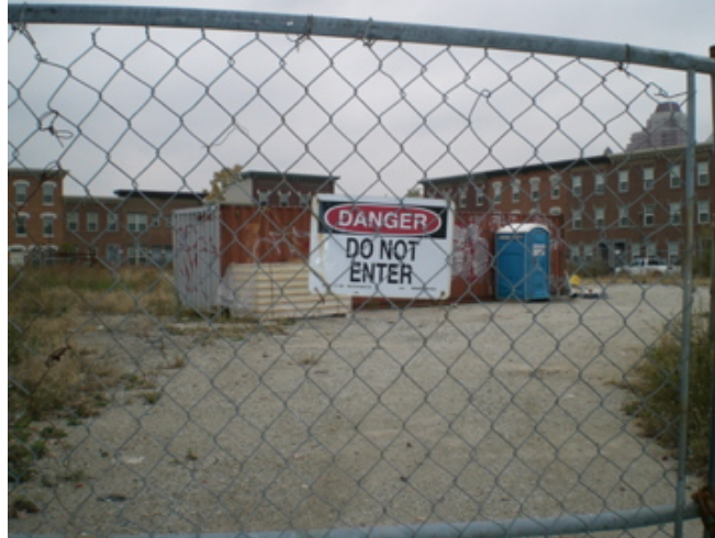
Figure 7: 12th and Catherine Sts., vacant lot where park was intended.

In 1965, Martin Luther King, Jr. delivered a speech on the steps of the Hawthorne Cultural Center. Two years after his assassination, the residents successfully advocated for the name of the project to change from Hawthorne Square to the Martin Luther King Plaza. The round building on whose steps he delivered his speech has become a very historic and precious landmark for the community, whose members do not want the building to come down. Though the building is structurally sound, it needs to be renovated before it is safe to use. Ironically, the doors of this community center were open when the towers still stood, but since the towers came down this building has been locked. HOPE VI money was budgeted for the revitalization of the Cultural Center, which was promised to the community during initial negotiations.