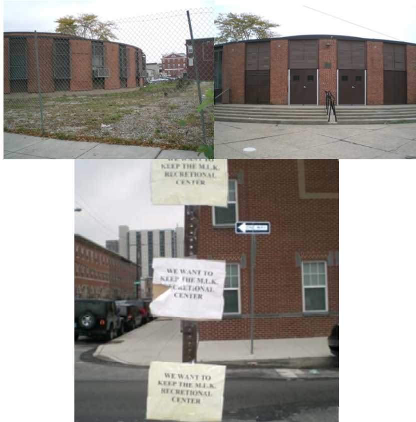
Figure 8: MLK Community Center from the side and back. Posted signs outside the building.