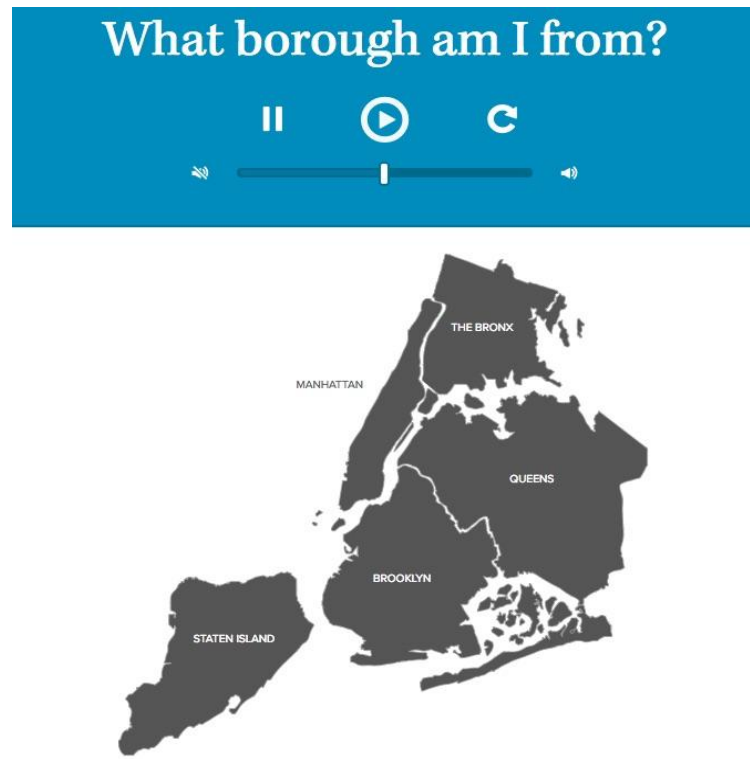
Figure 1: Screenshot of a voting page from www.newyorkcityaccents.com .

We built an interactive website, www.newyorkcityaccents.com , which invites participants to listen to native NYCE talkers and assign them to one of the city's five boroughs. Visitors to the homepage were told that the site “explores the common idea that New Yorkers can identify what borough other New Yorkers are from based on the way that they talk” and invited to take a series of quizzes. Each quiz included three talkers. To start a quiz, listeners were taken to a page like that in Figure 1, where they listened to a native New Yorker reading a short passage, and then selected the borough they believed the talker to be from. Before seeing how other listeners had voted for this particular talker, they were asked to self-identify as either a native New Yorker or not, 6 and then they categorized the final two voices in the quiz. Before finding out which borough each talker was from, listeners were asked to opt-in to our research. If they chose to do so, listeners created an account and filled out a demographic survey. Native New Yorkers were also invited to submit their own speech samples by leaving a voice message through the service Twilio, with the intent to collect additional talker samples through a modified snowball sampling method and add them to the site at a later date.