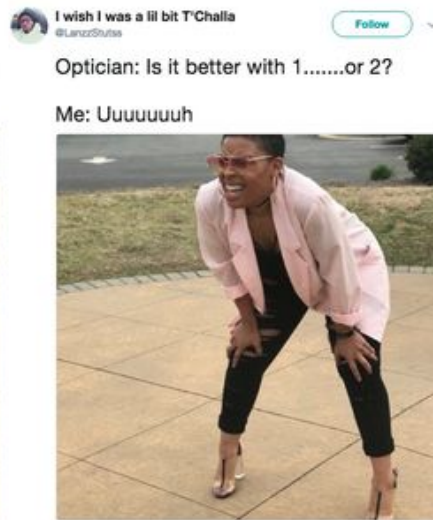
Figures 3-6. “Squinting Woman” memes created by other, random, Twitter users

Internet memes, specifically memes for “use”, are also successful due to their intertextuality , as the interconnection of cultural contexts within Internet memes add on to their efficiency as a form of visual rhetoric. These cultural references allow numerous ideas, from jokes to political messages, to be conveyed to and understood by online audiences (Huntington 2013). When an Internet meme’s message is then generally understood by and generally appealing to the online public, it is vastly shared and/or remade which makes itself known as an Internet meme.