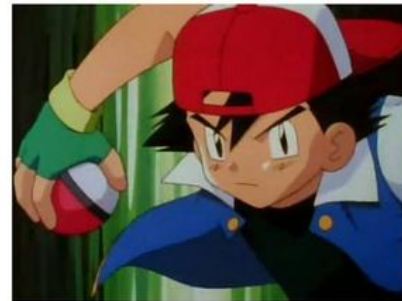
Figures 7-9: Examples of: “Relatable posts” memes.

When people start to tag their friends in an online argument