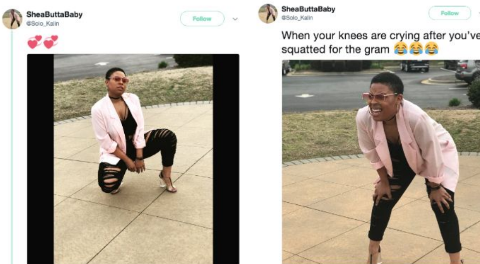
Figures 1 & 2. Original posts by @Solo_Kalin