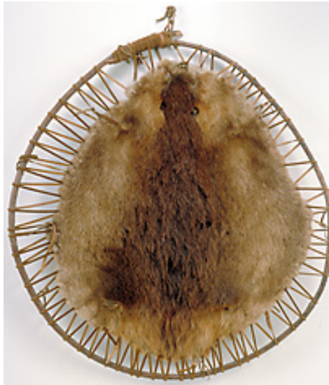
By the 1650, the beaver population in the middle Connecticut River Valley had dropped dramatically, but the hunting in the Adirondacks was still plentiful.