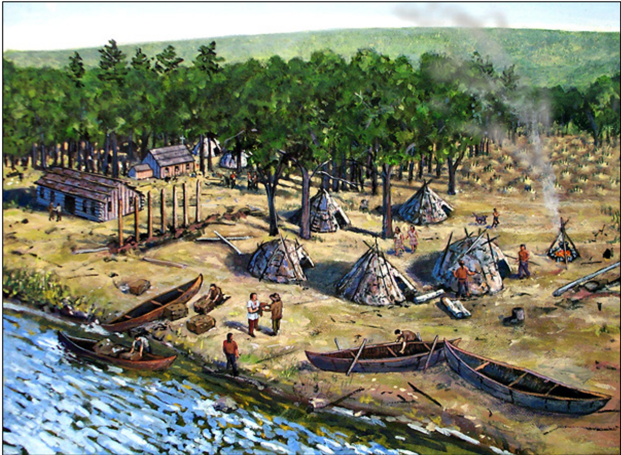
This artistic rendering of the Wôbanaki settlement on the Arsikantegouk (Saint Francis River) depicts wooden frame houses, bark wigwams, a small Catholic church, and the beginnings of a military stockade, circa 1690. Illustration copyright Frank Gregory.