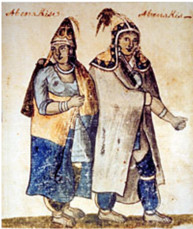
This 18th century French illustration demonstrates the mixture of French and Native dress that was typical of Wobanaki people, who combined trade goods like linen chemises and wool blankets with indigenous deerskin leggings and decorative markings.

There was a Catholic church at Odanak, staffed by a Jesuit priest who incorporated the Abenaki language into the text and hymns, in an attempt to both accommodate the spiritual needs of Wôbanaki people and encourage conversions. (11) While some accepted Catholicism, others maintained traditional Native practices and beliefs that have persisted to the present day.