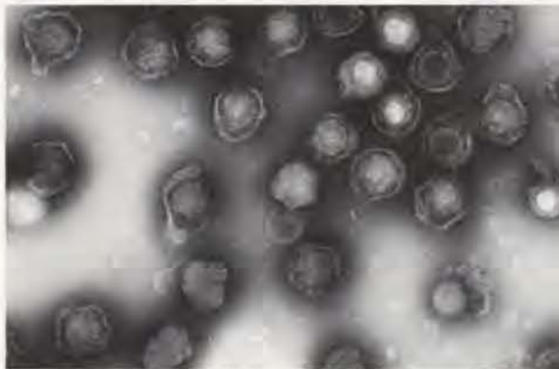
Bovine herpesvirus 1