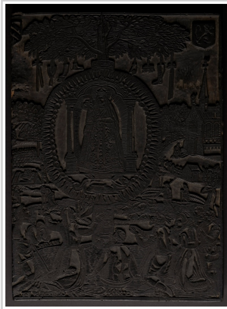
Woodblock (UPenn Object Coll. Box 27)