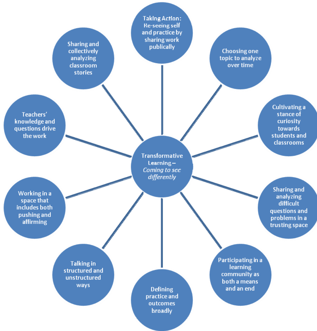
Figure 1: Conditions and Practices for Transformative Learning in the Adolescent Literacy Education Study Group

This figure displays the diversity of practices and conditions that caused changes in the group members, their teaching practice, and their sense of selves. It reflects many of the tenants of adult learning theory in that these practices and conditions allowed the teachers