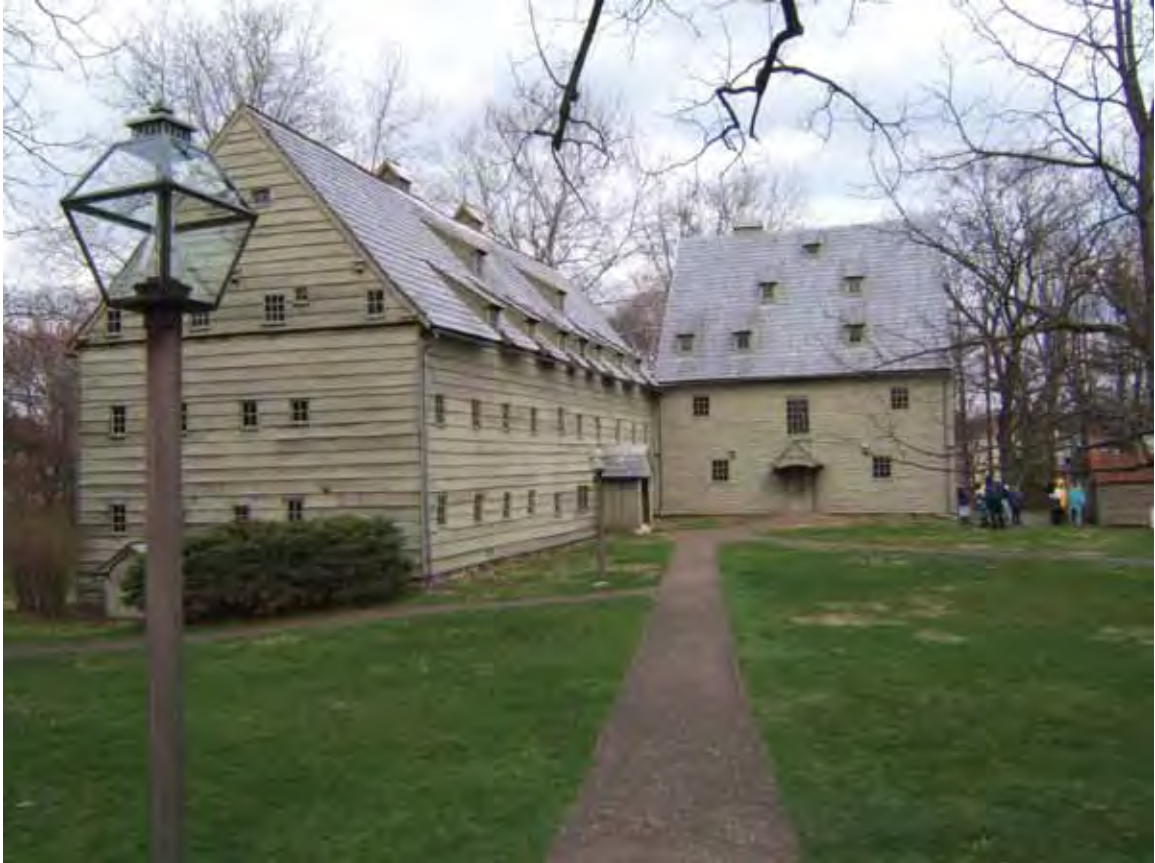
FIGURE 6 – The Saal and Saron at Ephrata Cloister, post-restoration. View of front.