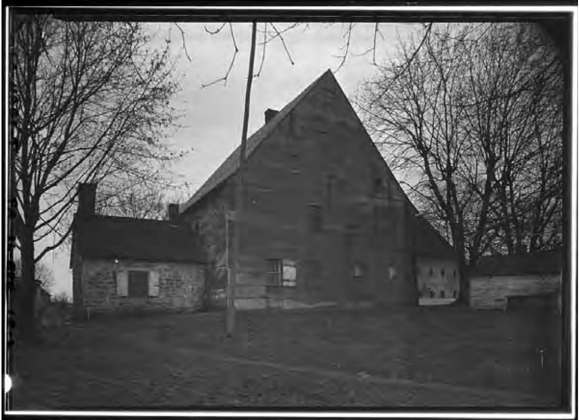
FIGURE 3 – The Saal at Ephrata Cloister, conditions pre-restoration. View of rear.