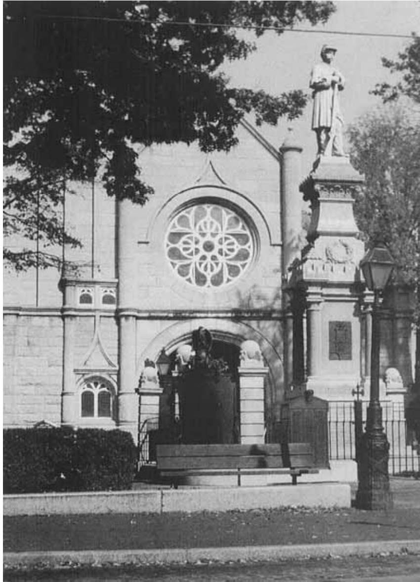
FIGURE 15 – Germantown’s Market Square Presbyterian Church.