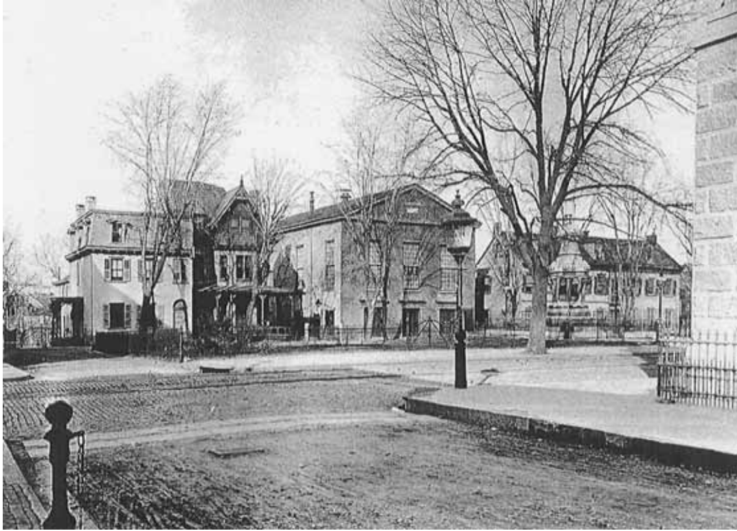
FIGURE 14 – Germantown Market Square in the mid-1880s. (Image: Contosta, Philadelphia's "Miniature Williamsburg": The Colonial Revival and Germantown's Market Square )