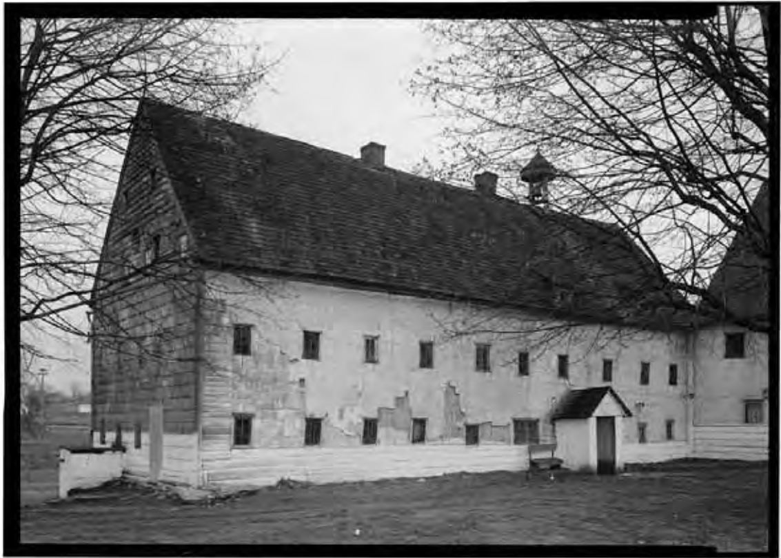
FIGURE 4 – The Saron at Ephrata Cloister, conditions pre-restoration. View of front.