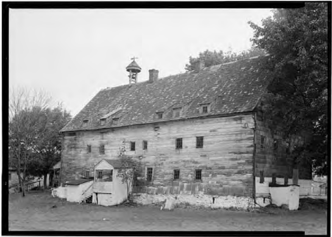
FIGURE 5 – The Saron at Ephrata Cloister, conditions pre-restoration. View of rear.