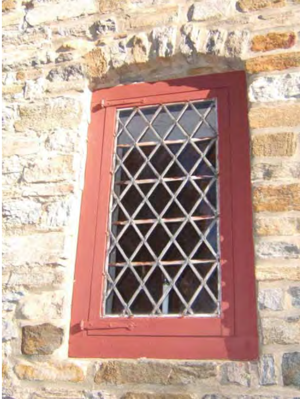
FIGURE 11 – The Brinton 1704 House, post-restoration. Detail of leaded glass casement window.