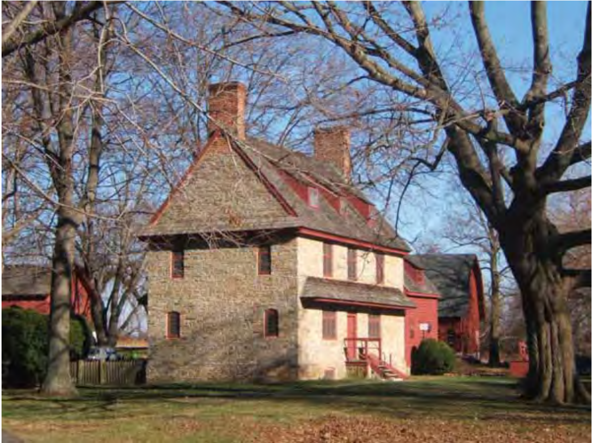
FIGURE 8 – The Brinton 1704 House, post-restoration.