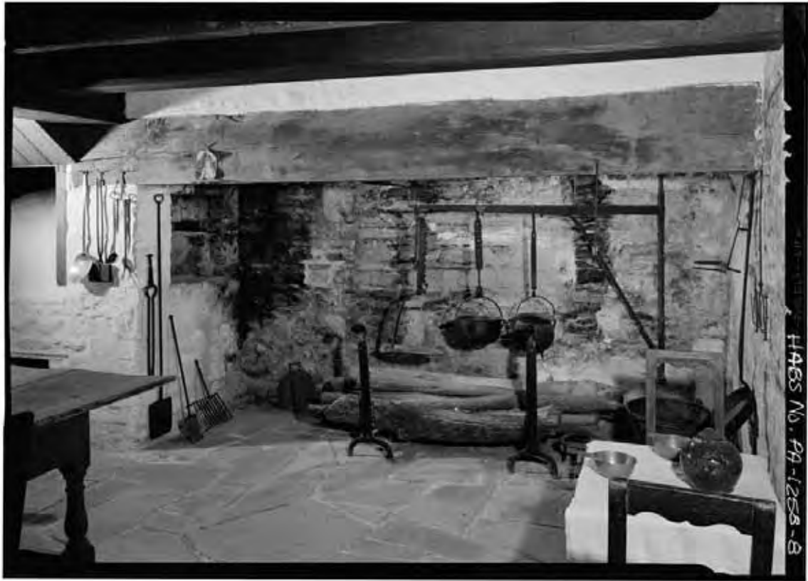
FIGURE 12 – The Brinton 1704 House, post-restoration. Interior view of basement kitchen.