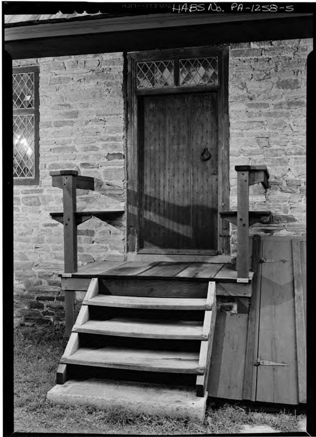
FIGURE 10 – The Brinton 1704 House, post-restoration. Detail of front door and leaded glass transom window.