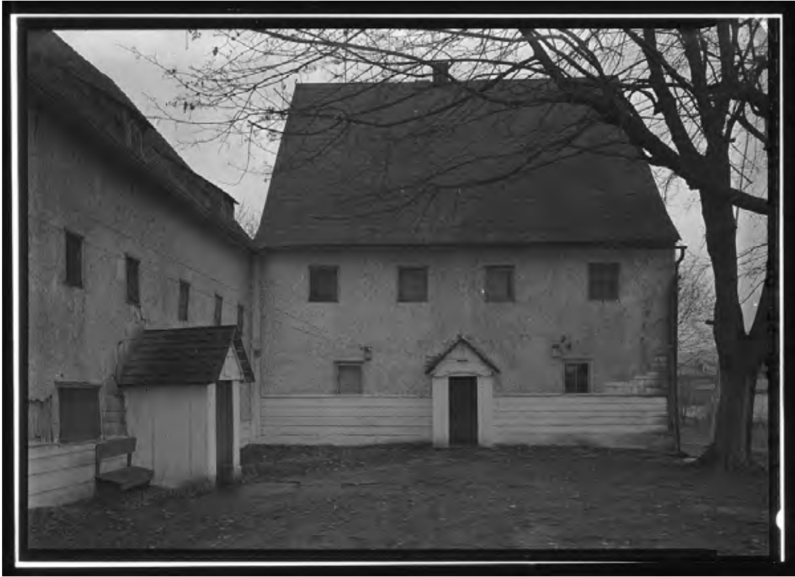
FIGURE 2 – The Saal at Ephrata Cloister, conditions pre-restoration. View of front.