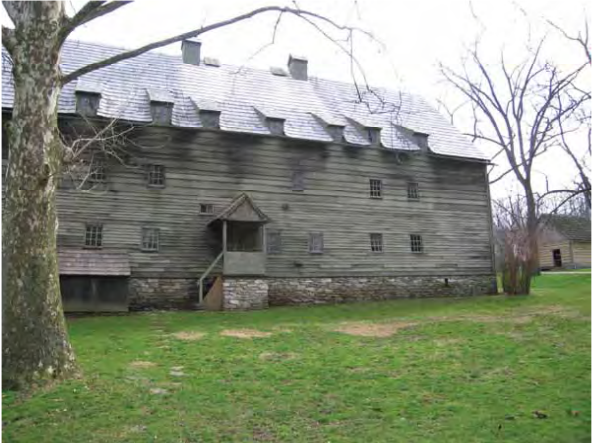
FIGURE 7 – The Saron at Ephrata Cloister, post-restoration. View of rear.