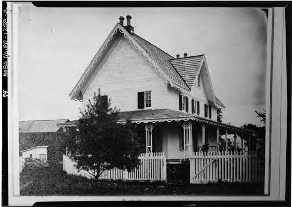
FIGURE 9 – The Brinton 1704 House, c.1870, with nineteenth century additions.