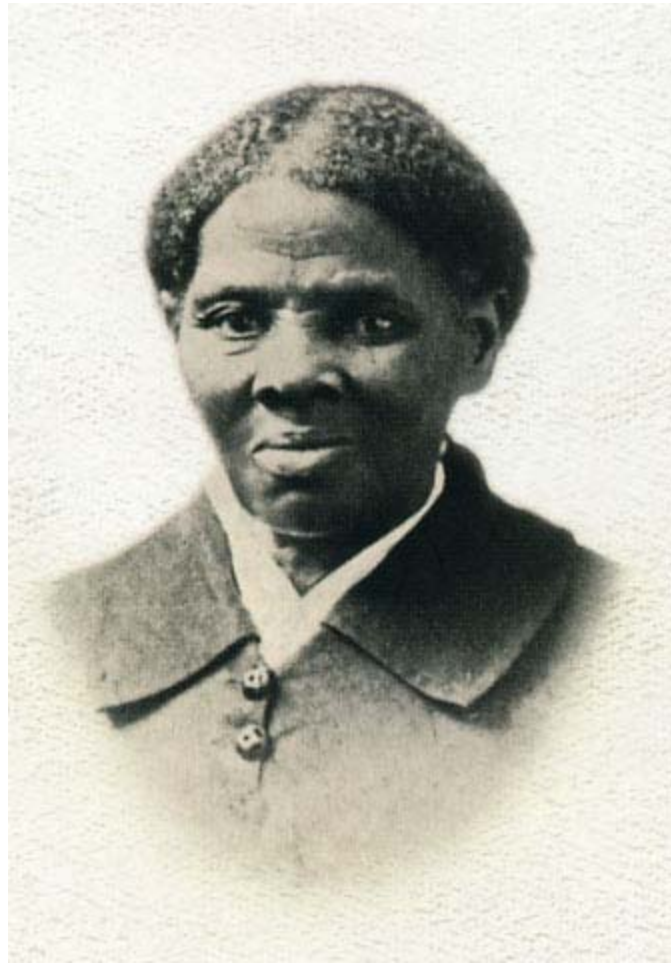
Harriet Tubman