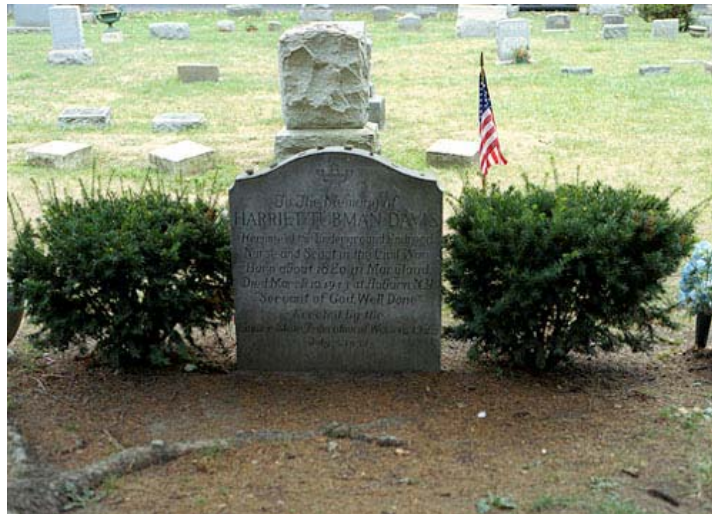
Harriet Tubman Grave Site (Tour Auburn, NY)

Harriet Tubman was laid to rest with military honors in a picturesque setting of winding paths and a hilly landscape at Fort Hill Cemetery in Auburn, New York on March 13, 1913. Only a Norway spruce marked her grave until 1915 when the Empire