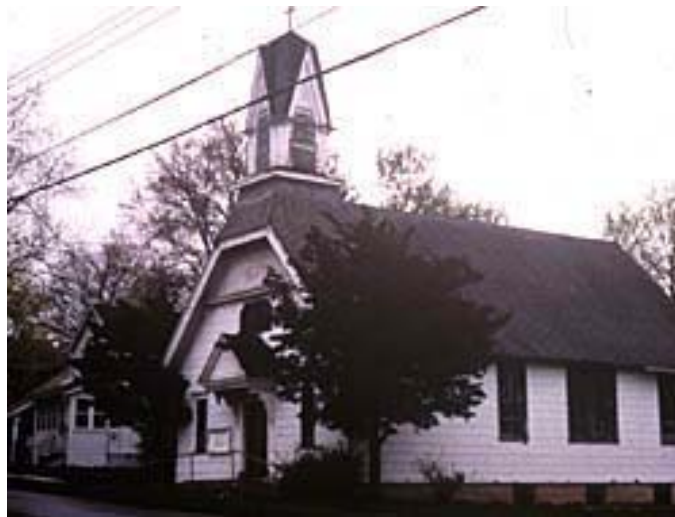
Thompson Memorial AME Zion Church (National Historic Landmark)

The Thompson Memorial A.M.E. Church stands on residential Parker Street, in Auburn, New York. When Harriet Tubman first came to Auburn, she and her family were members of the Central Presbyterian Church, which is described in the Documented Sites