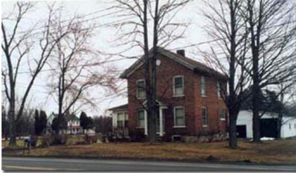
Harriet Tubman Residence

The Harriet Tubman Residence is located at 182 South Street, in Auburn, New York. On May 25, 1859, William H. Seward, a New York Senator and the future Secretary of State under the Lincoln Administration, sold Harriet Tubman a small parcel of property of seven acres, on the town line of Fleming and Auburn, New York. “The lot consisted of a house, a barn, several outbuildings and tillable land, providing ample room for Tubman, her parents and any other family members or friends who were in need of a home.” 59 The house was destroyed by fire sometime between 1882 and 1884. Shortly thereafter Tubman, her family, and friends, built a brick residence on the foundations of the original wood-frame dwelling. 60