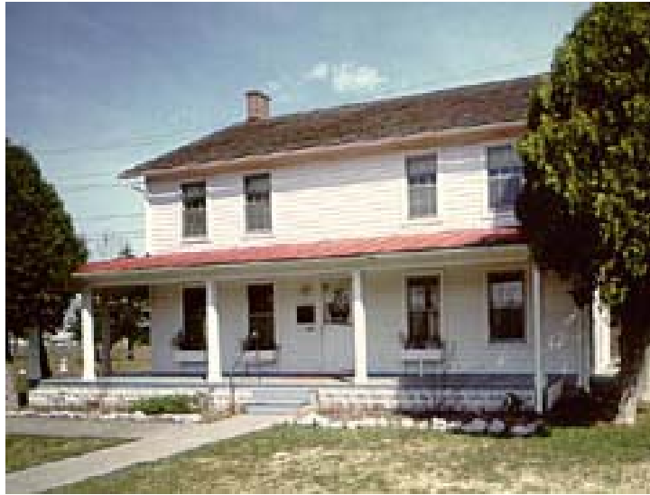
Harriet Tubman Home for the Aged (National Historic Landmark)

The Harriet Tubman Home for the Aged stands at 180 South Street in Auburn, New York. In 1896 Harriet Tubman purchased twenty-five acres of land adjoining her property to the North. Two circa 1860s houses, one brick and one wood-frame, as well as barns and other out buildings, stood on this tract of land adjoining the property of her residence to the north. She had a vision to set up a home for freed slaves who could no longer care for themselves. Because there was a shortage of funds Tubman deeded the land to the Thompson Memorial A.M.E. Zion Church, in 1903, in the hopes that they could bring her dream to a reality. 65 In 1908, the Harriet Tubman Home for the Aged and Infirm Negroes opened. 66 Tubman actively provided care for the Home's infirm residents until she joined them in May of 1911. Harriet Tubman died at the Home for the Aged on March 10, 1913.