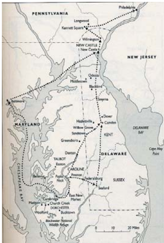
Tubman's Underground Railroad Southern Routes (Larson)