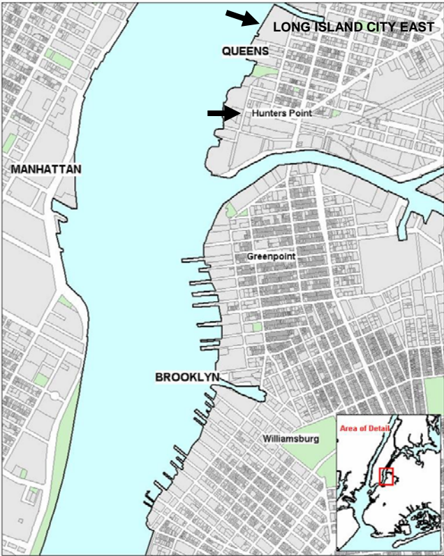
Figure 3: Long Island City and Hunter's Point, Queens