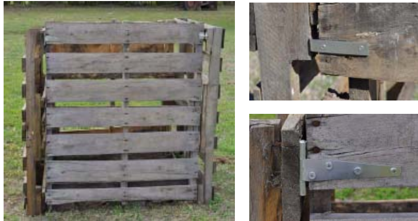
Figure 2: Example of a Pallet Compost Bin 8

The appropriate bin size is critical for maintaining productive compost. A bin should be larger than 3 ft by 3 ft by 3ft (27 cubic feet), as the decomposition process requires a certain mass to maintain a high temperature in the center of the pile as the compost cures. At the same time, a pile should not be too large as it may prevent valuable air flow from moving through the compost. Experts suggest a bin should not be larger than 5 ft by 5 ft by 5 ft (125 cubic feet) (Los Angeles County Public Works, 2002).