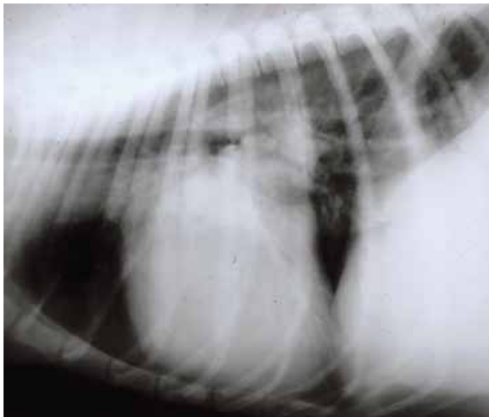
An X-ray of a dog's heart with DCM.

Currently, the gold standard for DCM diagnosis is to perform a cardiac ultrasound (echocardiogram) and to monitor the heart rhythm for 24 hours with an ambulatory electrocardiogram, known as a Holter monitor. These screenings are not inexpensive and while the expense may be justifiable for the owner of a single Doberman, it could be prohibitive for breeders who may wish to screen many dogs at once.