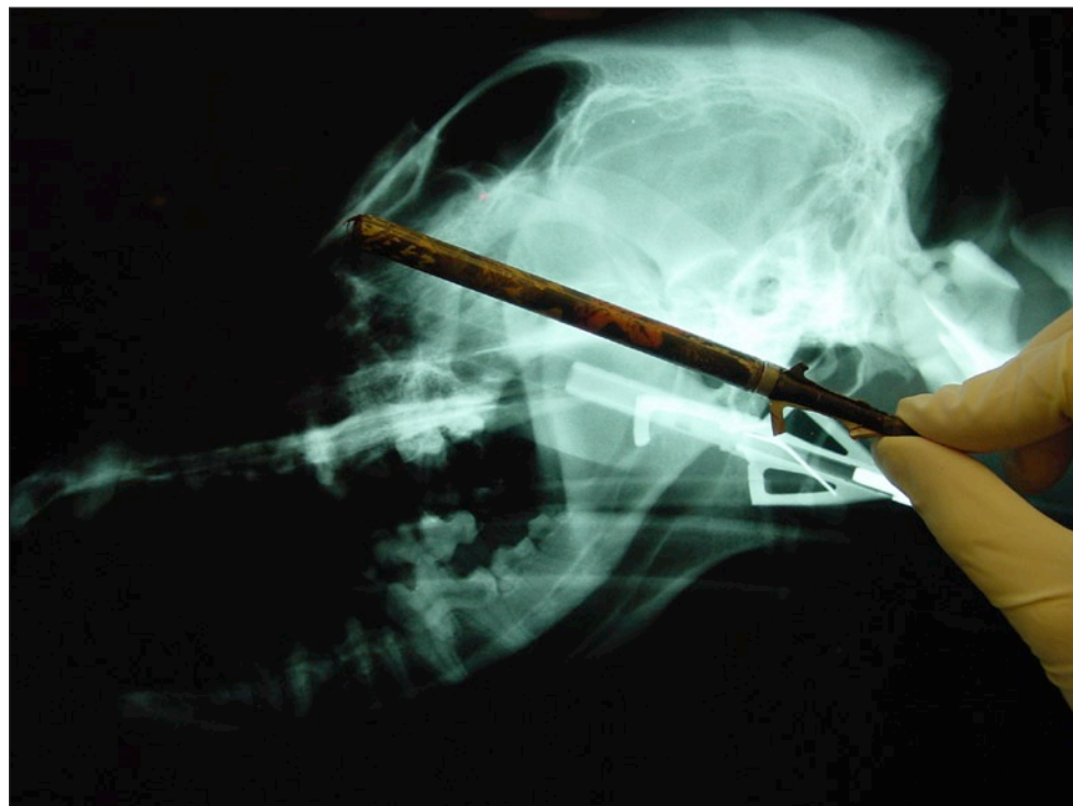
Broken arrow held up to x-ray after being removed from Alice.