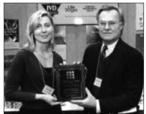
Innovative Veterinary Diets