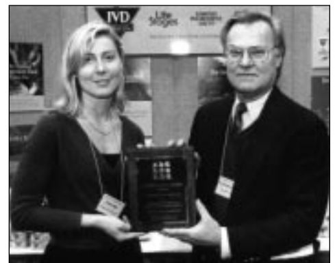
Innovative Veterinary Diets