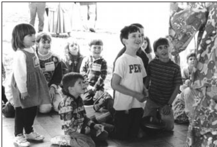
Future veterinary alumni enjoying Alumni Day!