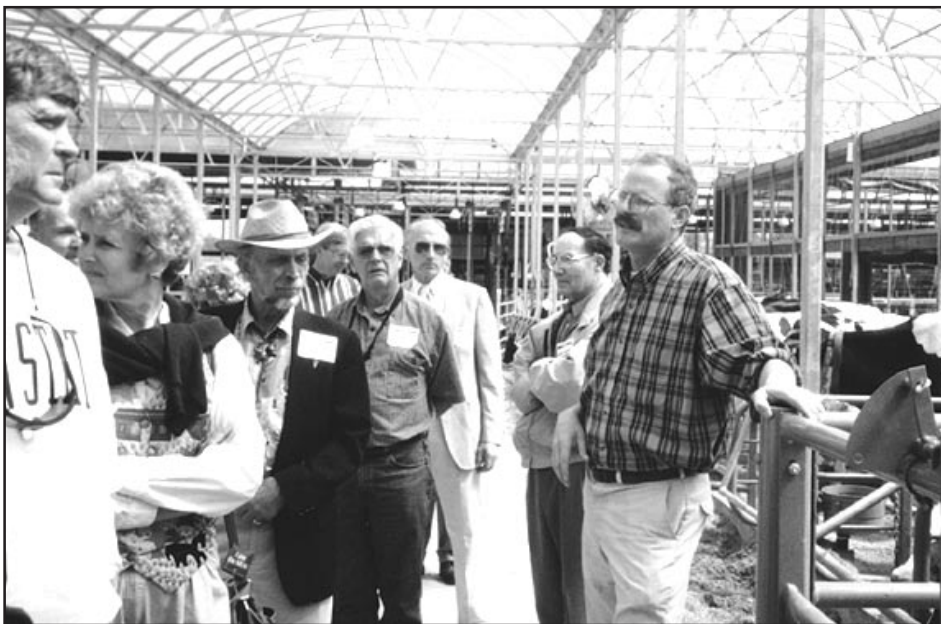
Tours of the Marshak Dairy were a big hit.