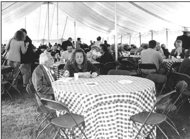
Over 300 alumni, friends and family enjoy lunch under the tent at New Bolton Center on Alumni Day.