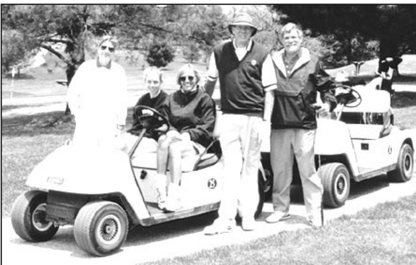
In line to tee off.