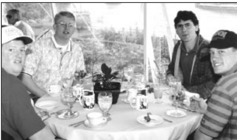
A foursome of recent graduates enjoys the tournament breakfast.

To help make this a useful and effective source of School and alumni information, please fill out the forms when you receive them from Harris Publishing. If you have misplaced your form or never received it, you can call the Alumni Office (215) 898-1481 and request another. See you on the pages of the directory in the Spring!