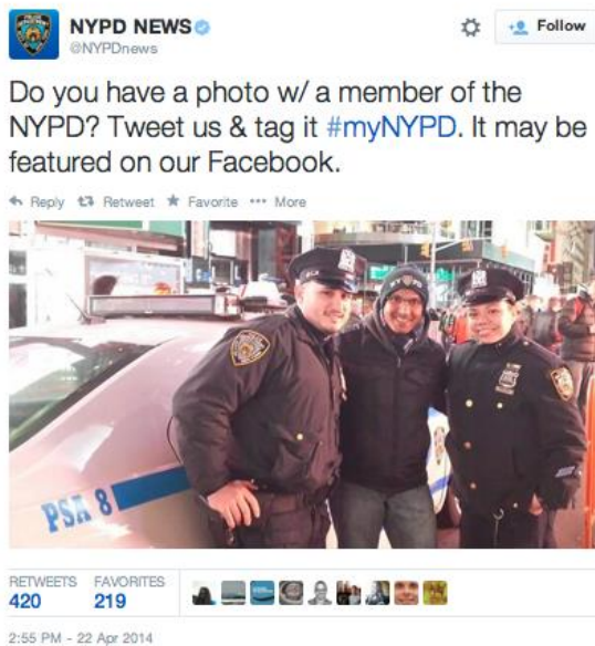
Figure 1. The original #myNYPD tweet, issued by the New York City Police Department (@NYPDNews) on April 22, 2014.