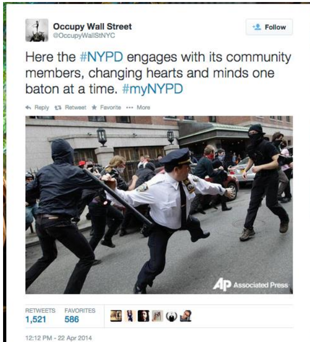
Figure 2. Example of a hijacked #myNYPD tweet, in this case Occupy Wall Street (@OccupyWallStNYC) using sarcasm to illustrate NYPD brutality.