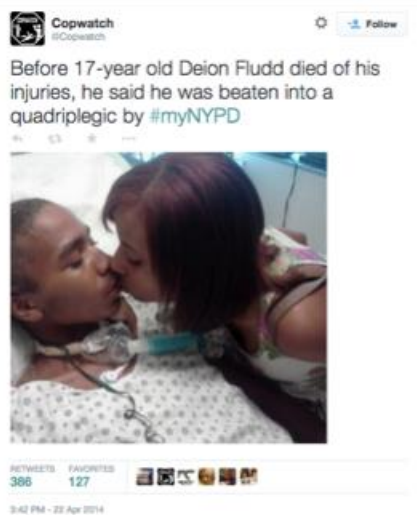
Figure 6. Examples of counterpublic tweets that use hyperbole (left) and outrage (right) as discursive strategies.