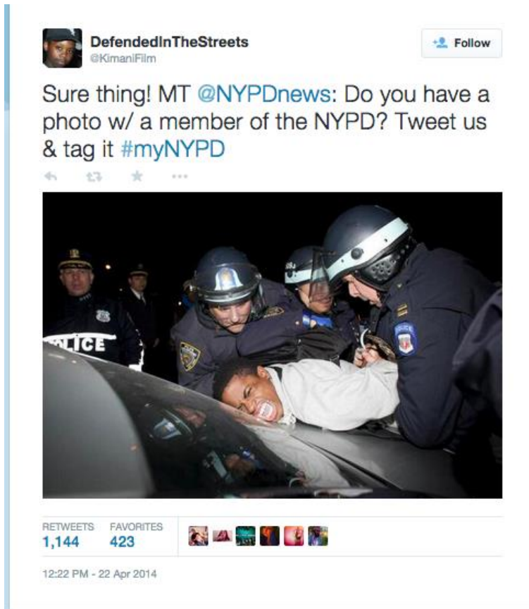
Figure 4. Hijacked tweet by @KimaniFilm retweeting the NY Police Department's (@NYPDNews) request for photos with a counternarrative image.