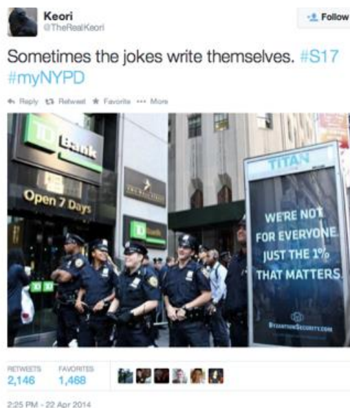
Figure 5. Examples of counterpublic tweets that use sarcasm (left) and snark (right) as discursive strategies.