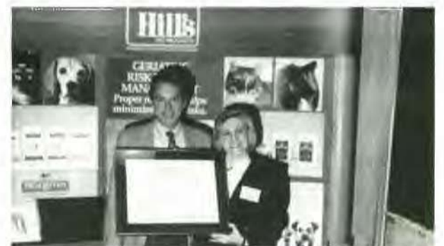
Hills Pet Products