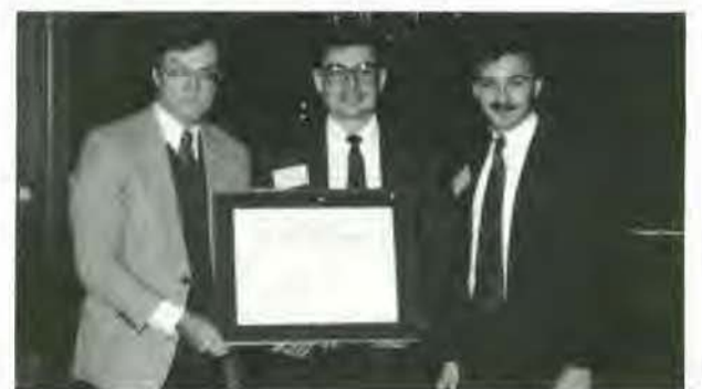
The IAMS Company

The 1993 Penn Annual Conference will be held at the newly-renovated Adam's Mark Hotel on Wednesday, January 20 and Thursday, January 21, 1993. We hope to see you there.