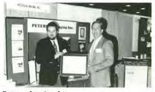
Peterson Imaging, Inc.