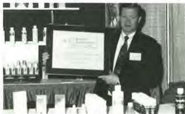
DVM Pharmaceuticals, Inc.