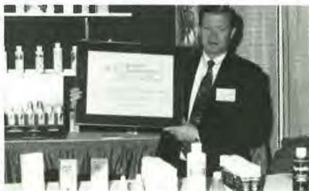
DVM Pharmaceuticals, Inc.