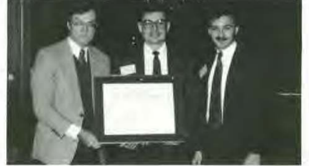
The IAMS Company

The 1993 Penn Annual Conference will be held at the newly-renovated Adam's Mark Hotel on Wednesday, January 20 and Thursday, January 21, 1993. We hope to see you there.