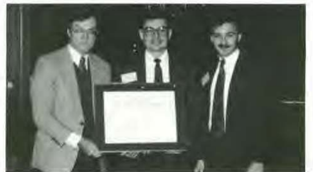
The IAMS Company

The 1993 Penn Annual Conference will be held at the newly-renovated Adam's Mark Hotel on Wednesday, January 20 and Thursday, January 21, 1993. We hope to see you there.