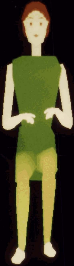
Figure 3-1: Three views of the Bubblewoman figure sliced and rendered with depth cued polygons.